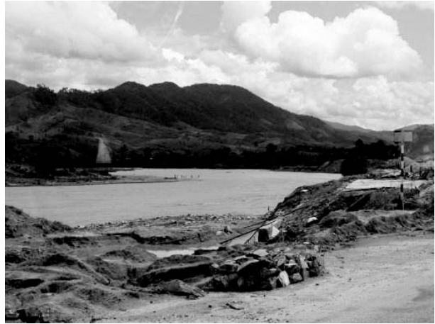
This erosion along Ho Chi Minh Highway (Route No. 14) in Dak Glei was caused by the Poko River.