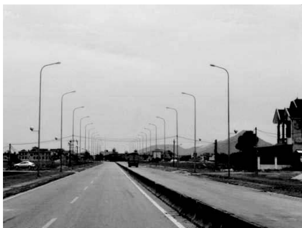
Route No. 12A (AH131) is a shortcut in Ky Anh Town.