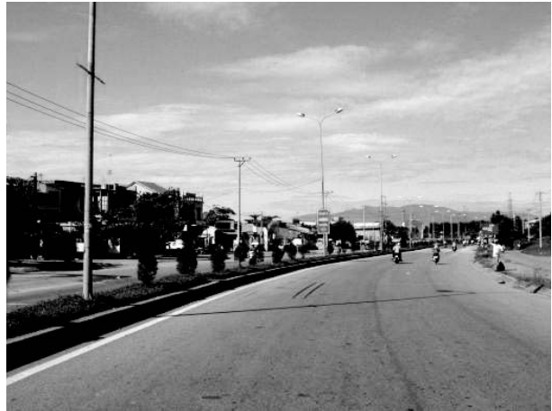
Route No. 14B as seen at a Danang suburb.

often threatened by landslides and erosion during the rainy season (from May to October).