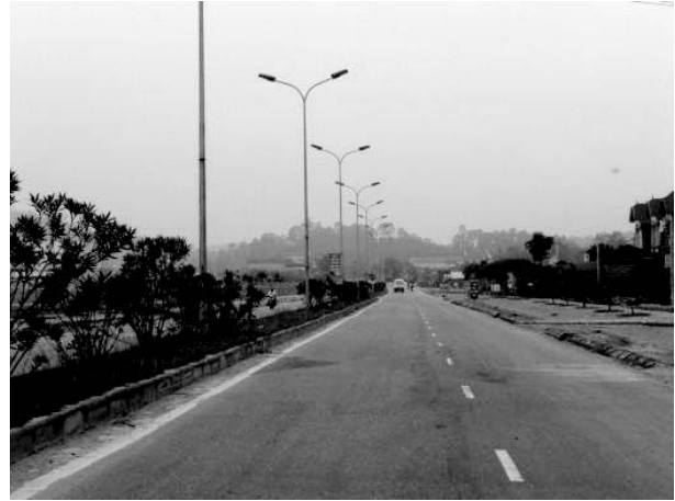
Route No. 8A near Duc Tho Town. This section is a dual two-lane road with median strip.

International Border Gate in Huong Son of Ha Tinh. The part in Vietnam utilizes Route No. 8A, Route No. 1A and Cua Lo Port (for vessels under 10,000 DWT) or Vung Ang Port (for larger vessels). This corridor is named as AH15 in the Asian Highway network. Route No. 8A, at 94 km, runs from east to west in the north of Ha Tinh Province, and crosses Huong Son and Duc Tho districts and Hong Linh Township. Urban areas along Route No. 8A include the towns of Tay Son, Pho Chau and Duc Tho, and Hong Linh Township. In Pho Chau (Huong Son District), Route No. 8A overlaps with Ho Chi Minh Highway for several km. At Truong Son (Duc Tho), Route No. 8A meets Route No. 15. At Hong Linh, Route No. 8A meets Route No. 1A.