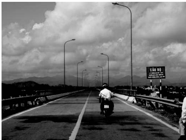
The Ro Bridge on Route No. 46A crosses the Lam River.

Nam Can International Border Gate in Ky Son, Nghe An, connects Xiengkhuang Province with the ocean via Route No. 7, which was constructed by the French during the colonial period. This corridor plays a crucial role for the foreign trade of several provinces in north Lao PDR. Due to Laos' steep Phou Bia mountain range, with elevations sometimes exceeding 1,500 m, Route No. 13 north from Vientiane to Luang Prabang is very tough for drivers. Therefore, the import and export cargos of Luang Prabang and Xiengkhuang provinces are not conveyed along north-south Route No. 13 but along west-east Route No. 7. The corridor is also an important connection between hinterland northwest Nghe An and the active economy of southeast Nghe An in Vietnam.