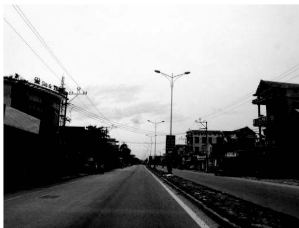
Route No. 12A (AH131) as seen in Ba Don Town.