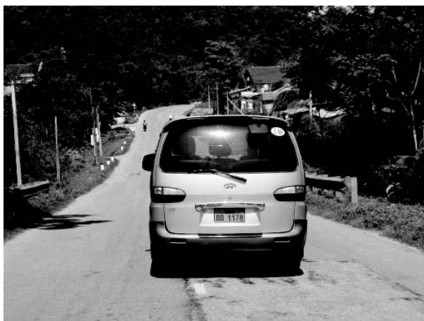
A Lao van on Route No. 7A in Tuong Duong. The road here is about 5 m wide.