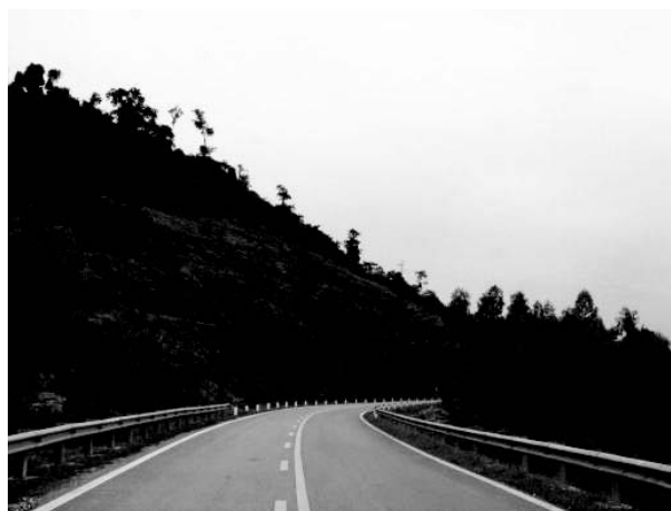
Route No. 12A (AH131) shortcut in Ky Anh District