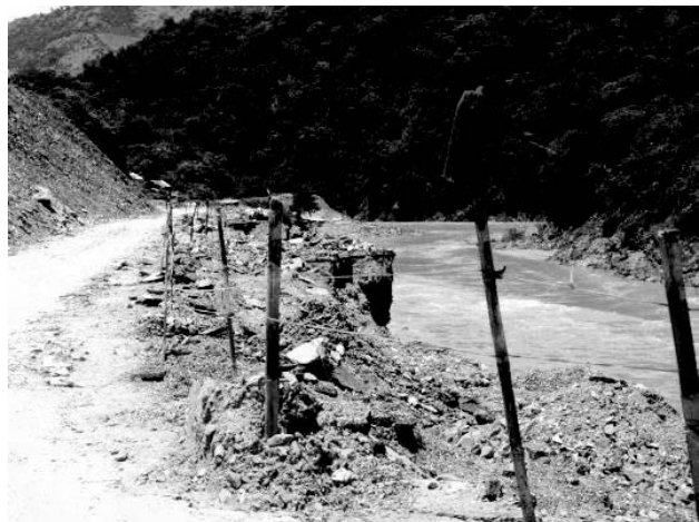
Route No. 7A in Ky Son suffered erosion by the flash flood at Nam Mo River in July 2011.