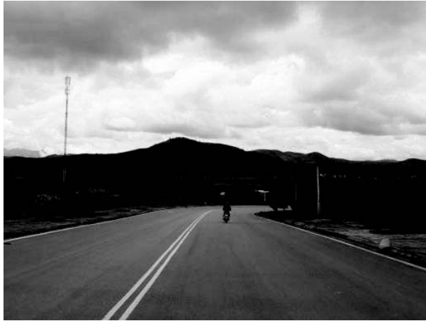
Route No. 40 as seen in Ngoc Hoi, Kon Tum. flooding from