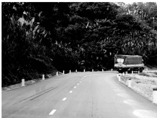
A truck travels on Route No. 12A in the Mu Gia Pass.