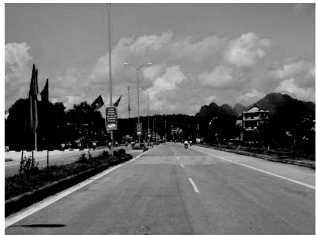
Route No. 7A in Anh Son Town has two lanes each way with a median strip.