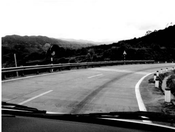
Ho Chi Minh Highway as seen at the Lo Xo Pass, Dak Glei, Kon Tum.