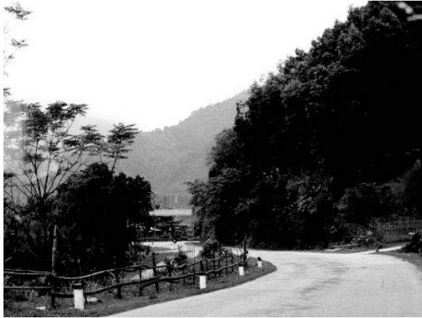
Route No. 8A at the foot of the Keo Nua Pass in Son Kim 1 Commune, 20 km from the border. The road surface here is a stone chip-tar asphalt mix.