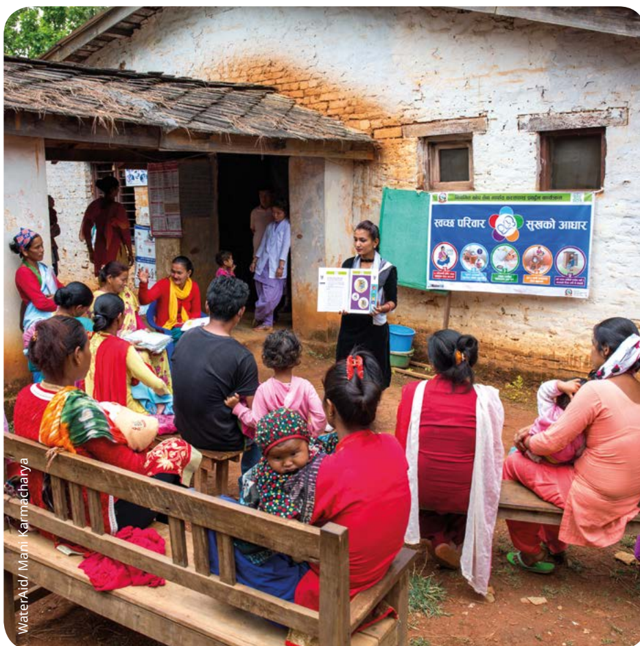
A female health volunteer conducting a hygiene session at District Hospital Khalanga, Jajarkot, Nepal.

With the effects of climate change growing increasingly extreme and threatening to reverse WASH progress for some of the poorest and most climate-vulnerable communities, services must be adapted and made resilient.