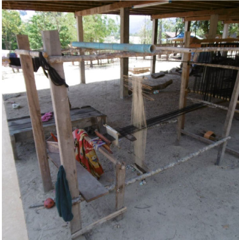
One of several looms producing handicrafts at Sop On

is far removed from the traditional way of life of the older generation. Most resettlers have had some personal experience in working in the other four livelihood areas, but vocational training is breaking new ground; which underlines how important well researched and focused training is provided it is in building up the off-farm pillar. Again it seems likely that the new generation of resettlers may have a unique contribution to make.