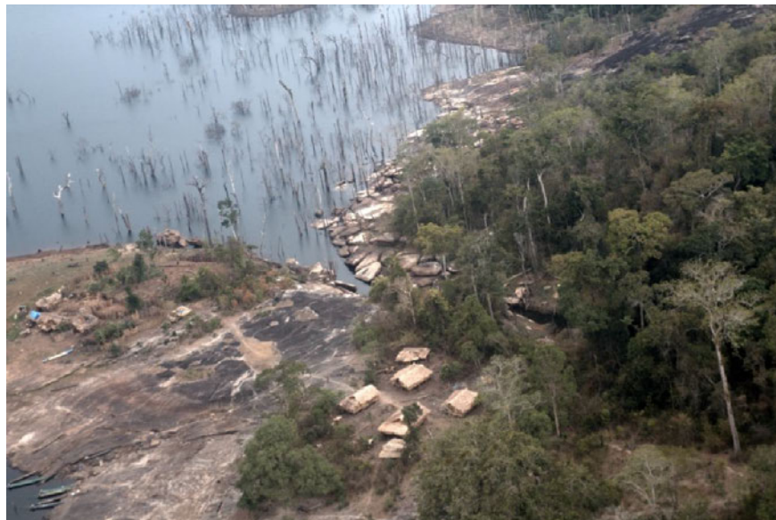
Aerial view of Old Sop Hia

“Ahoe villagers have a spiritual and ancestral connection to the old Sop Hia Site, and they should be permitted to establish a permanent village there; the village should be officially classified as a NNT NPA village, and accordingly NTPC and WMPA should approach the issue of development and livelihoods in this settlement just as they would for any other village in the NNT NPA, where the agreed upon emphasis is on balanced conservation and development.”