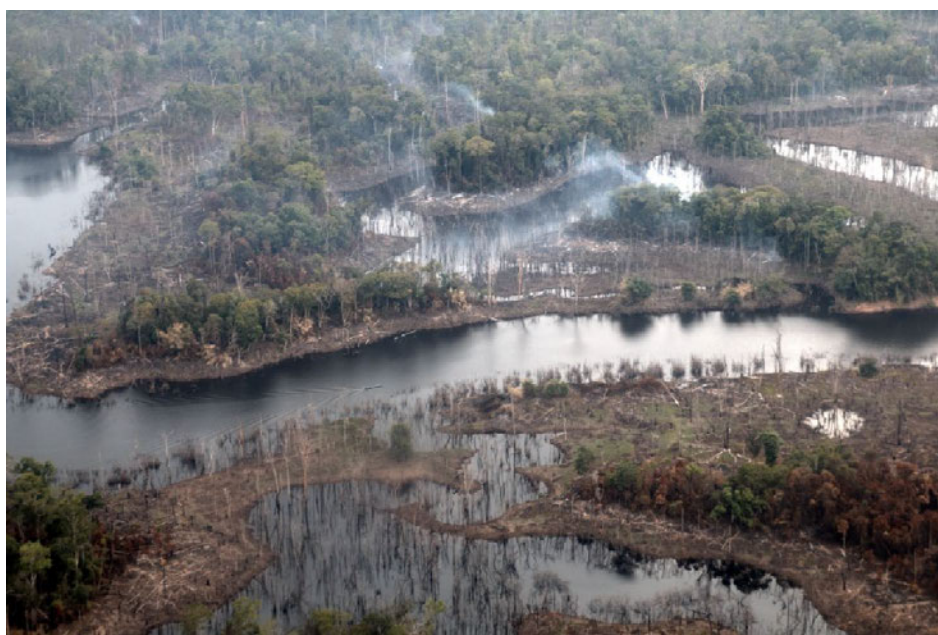
Fires on the Nam On inside the WMPA

Unfortunately it was staffed and managed as a normal GoL agency and has not achieved its special status or success. Because of the extremely serious problems with WMPA (see POE Report 22) GoL created a Task Force to restructure the organization. The POE has met with the Secretariat of the Task Force both on its 23 rd mission in 2014 and the present mission in 2015.