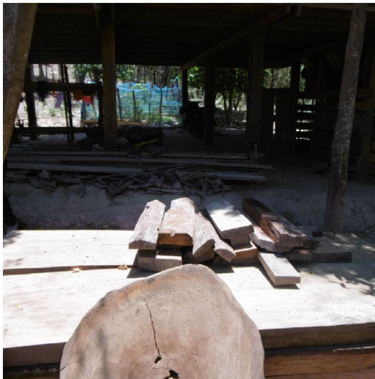
Illegally harvested rosewood under resettled houses

Beyond such action at the political level, a stepped up effort by GOL law enforcement agencies to counter illegal activities in terms of encroachment on resettler forest (and other) land and illegal logging is called for. Such illegal activities will go on jeopardizing the efforts to raise income levels and achieve sustainability unless they are more effectively brought under control. Similarly, there is an urgent need for more equitable sharing of NT2 forestry revenues between the Government and the resettlers.