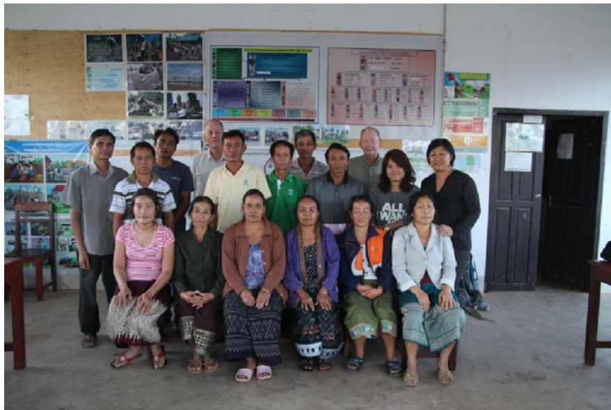
Village Development Committee and POE, Phonsavang

The resultant VDP has been described as a “21.7 billion kip wish list” of specific requests on the District – which is most unlikely anyway to be fully funded by the GOL. The process of developing it certainly does not seem firmly based on a detailed discussion among villagers themselves, with representation of all groups, of how they would best like to use their land and other resources to support their preferred mix of livelihoods.