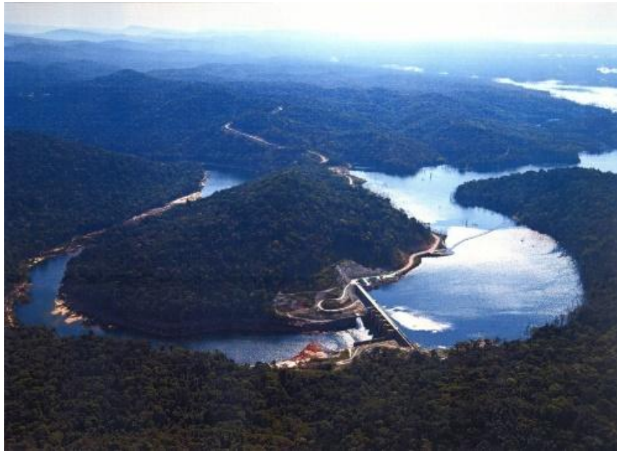
Dam on the Nam Theun, western end of the reservoir

generally acceptable level of competence. Historically the POE has queried in some of its earlier reports the roading work done by project sub-contractors and has drawn attention to the often excessive width of tree clearance for roads indulged in by these companies to the detriment of the environment and the topography in general. The Panel has also had to draw deficiencies in the water supply and irrigation systems to the NTPC's attention on several occasions. There are remaining inadequacies on these fronts but the Company is aware of them and is working on them. But the standard of work on resettlement housing and most other buildings, for example, has been generally high and is appreciated by the Resettlers.