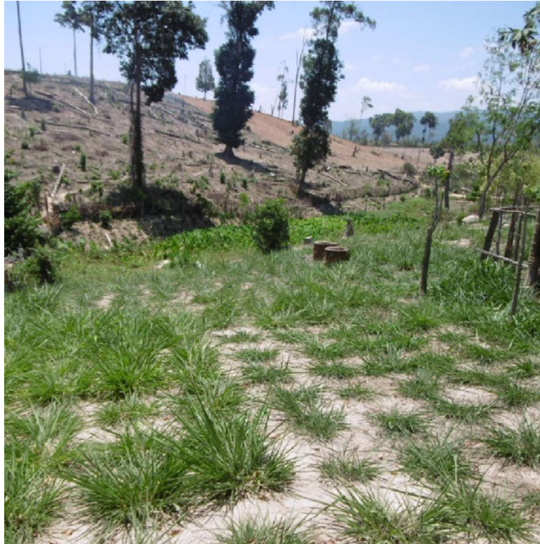
New forage planting for cattle, Sop On

So while the larger livestock are near the carrying capacity, they are not at present contributing to the sustainable livelihood of the resettlers and, on the contrary, are degrading unprotected forage resources. As Cook noted in his earlier report: “There needs to be a clear incentive for farmers to invest time, money and effort in moving from the currently unsustainable system that can only result in widespread land degradation and entrenched poverty among the people.” He noted that there seems to be few prospects for beneficial change, and as for the likelihood of such changes, Cook concluded during his 2014 visit: “I have not seen anything during this mission to alter this view.”