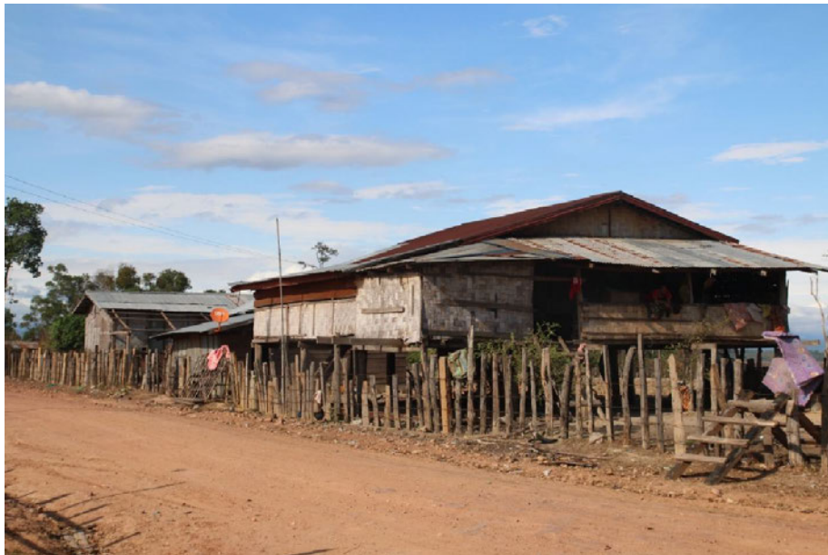
Housing of natural growth generation, Sop On

The root of the problem has lain in a fundamental difference of view over how to perceive natural growth households. The Panel, drawing on its global experience of other dam projects, has seen them as one of the project’s greatest assets. We view the contributions of this better educated group, more familiar than their parents with the nature of the national political economy and technological advances in which resettlement has incorporated them, as critical for the implementation of a successful resettlement process.