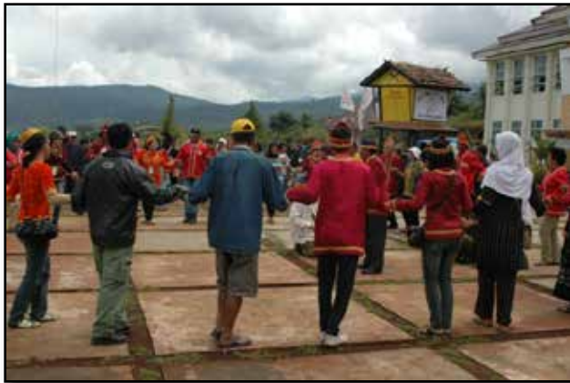
Hundreds of Karonsi'e Dongi women and men have joined the struggle against the mine

Since the company started operating, there have been various forms of protests and actions undertaken by the Karonsi'e Dongi such as blockades, demonstrations, sit-ins and hunger strikes. Efforts also included lobbying directly to PT Inco/PT Vale and holding policy dialogues with the local government and North Luwu parliament. Some civil society organizations have actively supported the community's efforts. These include filing cases for mediation with the local government and sending the human rights violations report to the National Human Rights Commission. The Karonsi'e Dongi families have tried to occupy the land around the