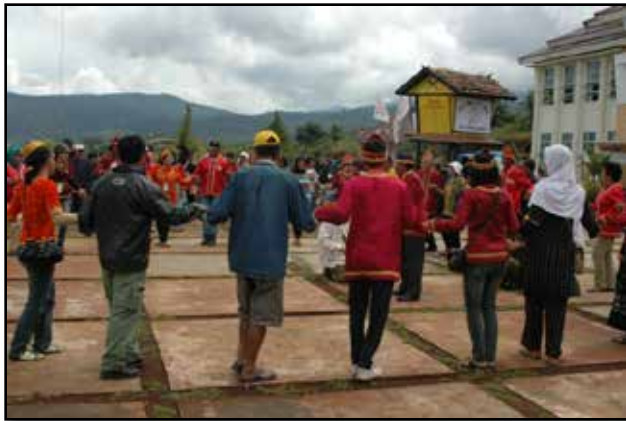
Hundreds of Karonsi'e Dongi women and men have joined the struggle against the mine

Since the company started operating, there have been various forms of protests and actions undertaken by the Karonsi'e Dongi such as blockades, demonstrations, sit-ins and hunger strikes. Efforts also included lobbying directly to PT Inco/PT Vale and holding policy dialogues with the local government and North Luwu parliament. Some civil society organizations have actively supported the community's efforts. These include filing cases for mediation with the local government and sending the human rights violations report to the National Human Rights Commission. The Karonsi'e Dongi families have tried to occupy the land around the