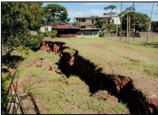
Land sinking at the central business area in 2009

Mankayan municipality in Benguet Province in northern Philippines is predominantly inhabited by the indigenous Kankanaey and Ibaloi peoples. In the past, these peoples relied on wet and dry subsistence agriculture, particularly rice farming, for their subsistence.