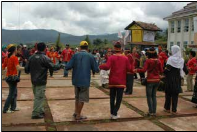
Hundreds of Karonsi'e Dongi women and men have joined the struggle against the mine

Since the company started operating, there have been various forms of protests and actions undertaken by the Karonsi'e Dongi such as blockades, demonstrations, sit-ins and hunger strikes. Efforts also included lobbying directly to PT Inco/PT Vale and holding policy dialogues with the local government and North Luwu parliament. Some civil society organizations have actively supported the community's efforts. These include filing cases for mediation with the local government and sending the human rights violations report to the National Human Rights Commission. The Karonsi'e Dongi families have tried to occupy the land around the