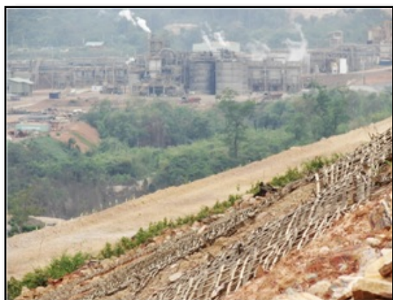
The Sepon mine is one of the biggest industrial projects in Laos

The villagers' forced relocation to focal sites has alienated them from their territory – the source of identity, subsistence, and the base of their culture. When the mining operations started, the village and its surrounding areas, including the Koh River they depended on, became so polluted that the villagers decided to move again. The pollution of the river severely limited their traditional farming practices and subsistence sources, crucial elements of the ethnic minority group's identity. For this "voluntary" relocation, Bua-Bandid not receives any compensation. As they are injected into a completely new environment, Bua-Ban and other the ethnic minority women nowadays face difficulties to meet food supply and ensure potable water in their homes. "Gathering wild vegetable has changed into growing food domestically and buying them from the market", Bua-Ban states and adds: "Living here in a totally new place, no money means no food. We cannot go and collect wild vegetables or catch wild fish like before. Indeed this is much different. We must have a job in order to have money to have food and to be able to send our children to school". The ethnic minority women are now having difficulties to