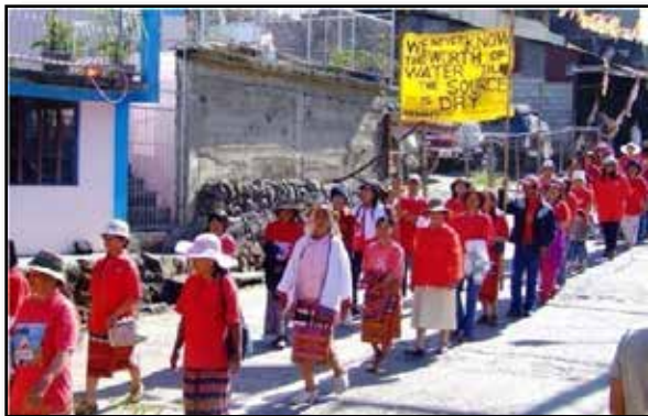
In March 2012, around 1500 women and men from different barangays joined the protest march against LCMC

Not only are livelihood sources affected, the general biodiversity is also damaged. Even common birds and tree species have disappeared. Negative health impacts of from air pollution on the surrounding indigenous communities have been extensively documented. 11 Water, soil and air contamination contributes to the increasing toxic build-up in people's bodies. The prevalence of asthma and other respiratory problems in local communities and mine workers has increased.