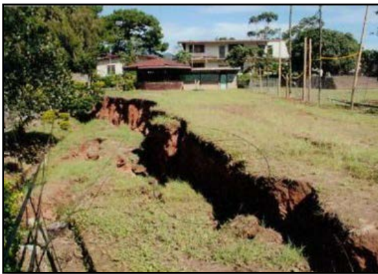
Land sinking at the central business area in 2009

Mankayan municipality in Benguet Province in northern Philippines is predominantly inhabited by the indigenous Kankanaey and Ibaloi peoples. In the past, these peoples relied on wet and dry subsistence agriculture, particularly rice farming, for their subsistence.