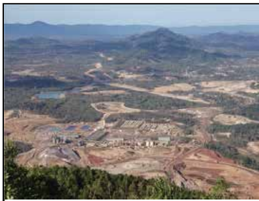
The Sepon mine project

Laos PDR is one of the most ethnically diverse countries in Southeast Asia. Various ethnic minorities, some of whom have very low populations call the mountainous areas of Laos PDR their home. They mostly depend on the forests, land and rivers for their sustenance, practicing rotational agriculture, gathering forest product and fishing the inland waters. The ethnic minority women are especially dependent on mountain rice production, forests and the rivers as their task is to provide for their family's daily food and maintaining the family welfare through their swiddens and forest food collection.