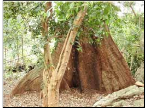
Big tree near the mining site

practices. The design of the relocation area is not culturally friendly for the performance of rituals, and thus, the cultural integrity of Bua-Ban's group has been undermined and threatened. Traditional knowledge and customary land management practices are likely to get lost as they cannot be practiced in the resettlement area. There are other numerous direct negative impacts of the mining operations on the environment such as water, air and land pollution and forests degradation, causing death to countless animals and endangering biodiversity. Before the arrival of the mines, Vilabouly was a wide and fertile rural district with a plenty of natural resources. Everybody could freely access natural resources without any restriction. When the mining project took over the land, the forests and fields were scraped off the face of the earth. Now that the forests are gone, ethnic minority women who are very dependent on these have lost access to critical food sources. Before, they were able to sell natural products from the forests to earn extra cash for their families. Now, this revenue or the products do not exist any longer.