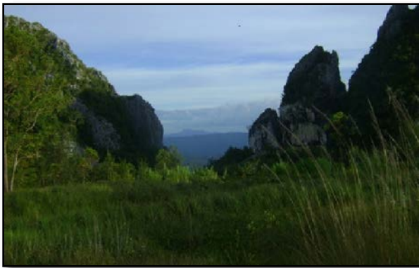
The sacred mountains of the indigenous Molo

In the past, the ancient hills were of high importance for the Molo. The sacred twin mountains Fatu Naususu and Fatu Anjaf were used as sacred sites and place for prayers. When community members passed away, they were buried in these sacred burial grounds. The mountains were also used as