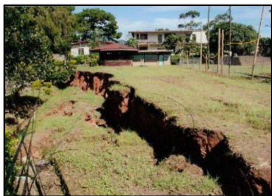
Land sinking at the central business area in 2009

Mankayan municipality in Benguet Province in northern Philippines is predominantly inhabited by the indigenous Kankanaey and Ibaloi peoples. In the past, these peoples relied on wet and dry subsistence agriculture, particularly rice farming, for their subsistence.