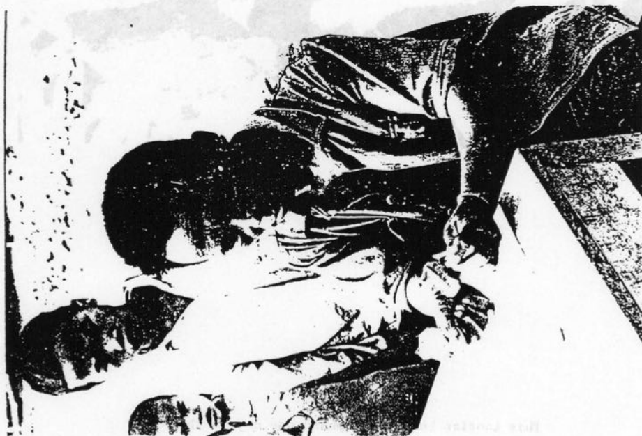
Pho Phouang, village chief of Ban Bouak.

"Once in 1968 a jet dropped butterfly bombs on our village. They were very small like a leaf. If you stepped on one it would explode and blow off your leg. These bombs came in two different colors, green and brown like the color of a dried leaf. No they weren't the same as bombs. (At this point, Pho Phouang cut two leaves one green and one dry and brown in order to show me what the butterfly bombs were like.) They only dropped these bombs once. And only one plane. But there were many. A thousand. More than a thousand. Ten buffalo were killed from stepping on the butterfly bombs. When the jet dropped the butterfly bombs there were no soldiers in the whole area. The bombs were very dangerous but we learned that it was safe to pick them up by one of the three corners. If we touched either of the wrong corners the bombs would explode and we would be killed. Yes, they were very dangerous.