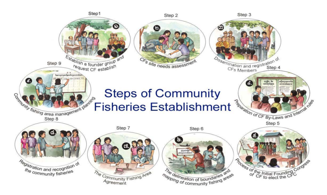
Step 1: A group of individuals, from a village or a group of villages, get together and decide that they would like to form a community fisheries organization in their area, over which they will have exclusive access rights. The motivation for this may come from a local NGO, a person like a monk in the pagoda, a member of the commune council or an enterprising person in the village. The first task is therefore to form a group of 'founders' who can take the project of organizing the community fisheries forward. This group of founders makes a formal request to the provincial office of the Fisheries Administration, stating their intent to form a community fisheries organization in their area and attaches a rough, hand-drawn map of the proposed area.

There are nine steps involved in setting up a Community Fisheries organization. These are briefly illustrated in the diagram below: