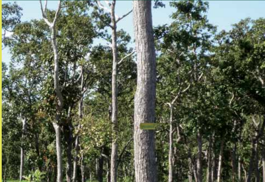
A deciduous forest in the target area of Oddar Meanchey.

The project was initiated by Community Forestry International in November 2007, adopted by the Forestry Administration and is currently being implemented in partnership with Pact. Funding support has been provided by Danida, DFID, NZAID, and the Clinton Climate Initiative through the Technical Working Group on Forestry and Environment. Project partners also include Terra Global Capital, the local NGO Children's Development Association (CDA), Monks CF Association, and local authorities in Oddar Meanchey province.