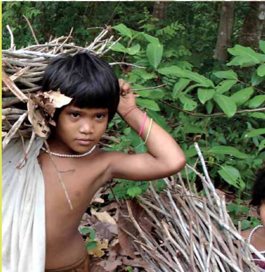
Children collecting firewood in the community forest area.