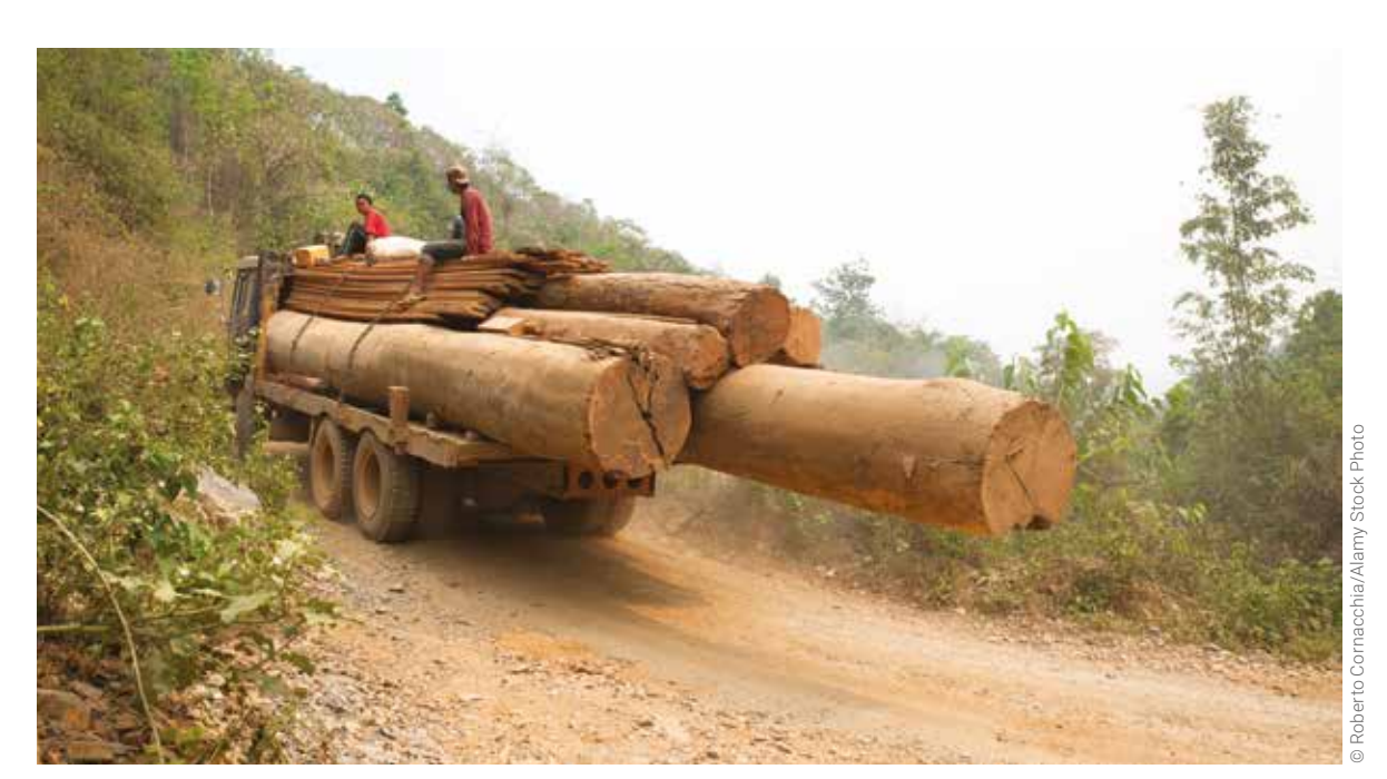
A truck transporting felled trees, Kayah state, 2016

start (and have been effective in the areas reached)<sup>21</sup> but, as preparations continue, could be extended to reach a much broader audience.