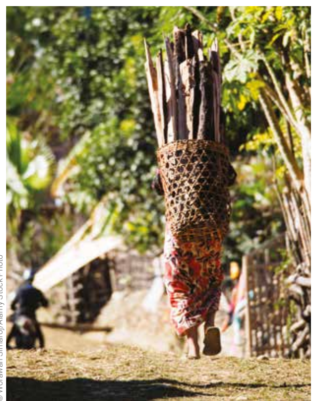
A Lisu woman carrying firewood collected from a nearby forest, Kachin state, 2014

UNEP and UN Women's report 'Unlocking the potential' flags up the important role that women play globally in managing and using natural resources, despite their structural exclusion from decision-making and ownership of natural resources such as land due to underlying inequalities. It calls for women's political participation and governance, protection and security as well as a role in economic revitalization.<sup>87</sup> Including women will make processes more inclusive, representative and effective – but this requires buy-in from the men and capacitybuilding for all government and community actors, which will be more effective at transforming society rather than women-focused trainings alone.