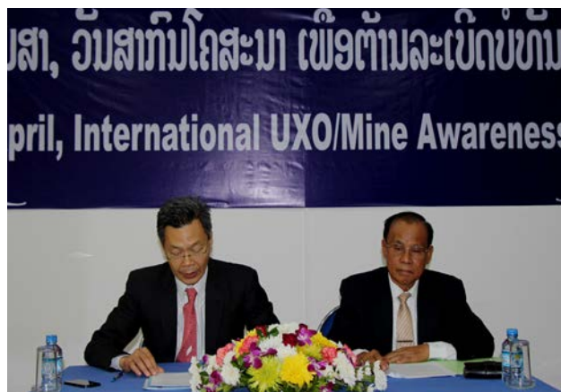
"Press Conference" to celebrate the 2014 International UXO/Mine Awareness Day, 4 th April 2014.

In 2014, 1,000 copies of UXO Sector Annual Report 2013 (500 English and 500 Lao versions) were printed and distributed to line ministries, donors, international organizations and operators. http://www.nra.gov.la/ in the section "Resources".