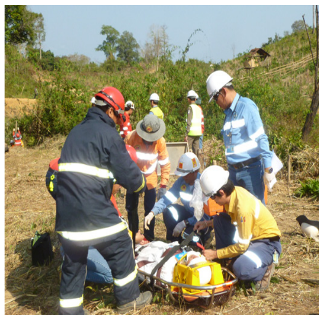
Casualty Evacuation Exercise (CASEVAC) conducted in a UXO clearance site by the Sepon Emergency Response Team (SERT).