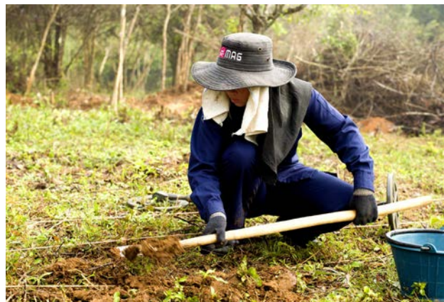
MAG Laos female technician carefully excavating the ground in Xieng Khouang province.

Community Liaison, which MAG pioneered within the UXO sector in the late 90s, is an integral part of MAG's