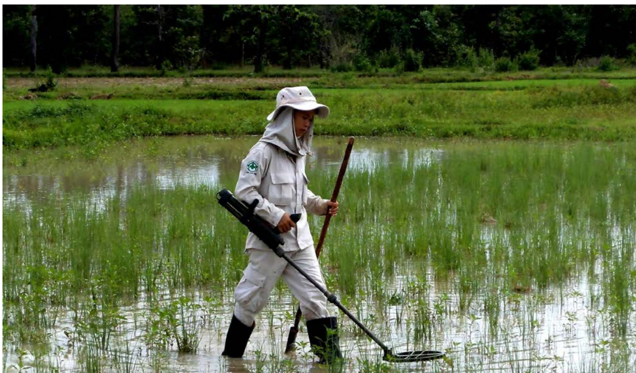
NPA Searcher Doing CMRS In a Rice Paddy Field.