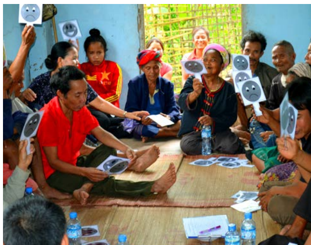
Barrier Assessment Session with persons with disabilities and UXO survivors in Sepone in September, 2014.

In 2014, HI has implemented community-based risk education session (safety briefing in group sessions gender and age-orientated, door-to-door visits and movie events) in 40 villages. It has allowed delivering direct UXO risk education messages to 13,000 beneficiaries, including 45% of women/girls and 53% of children. In addition, HI has developed a partnership with the NRA and the Ministry and Education and Sports for the implementation of school-based risk education activities as part of the national curriculum at primary school level.