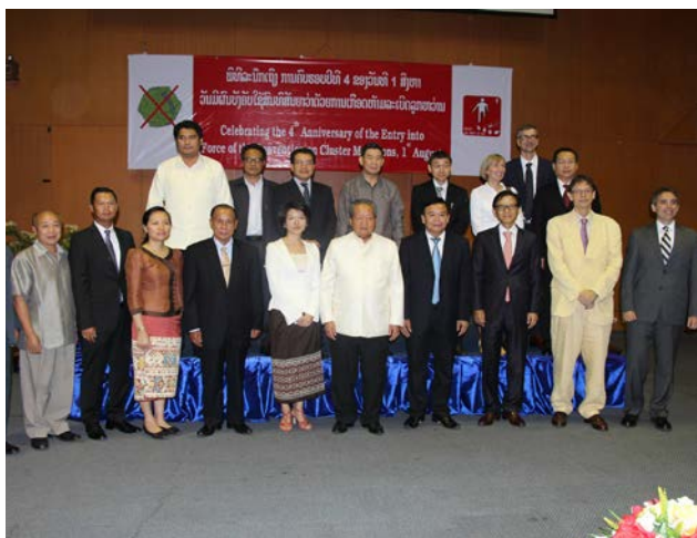
Group photo on the occasion to celebrate the Entry into Force of the Convention on Cluster Munitions (CCM), 1st August 2014, at ICTC.