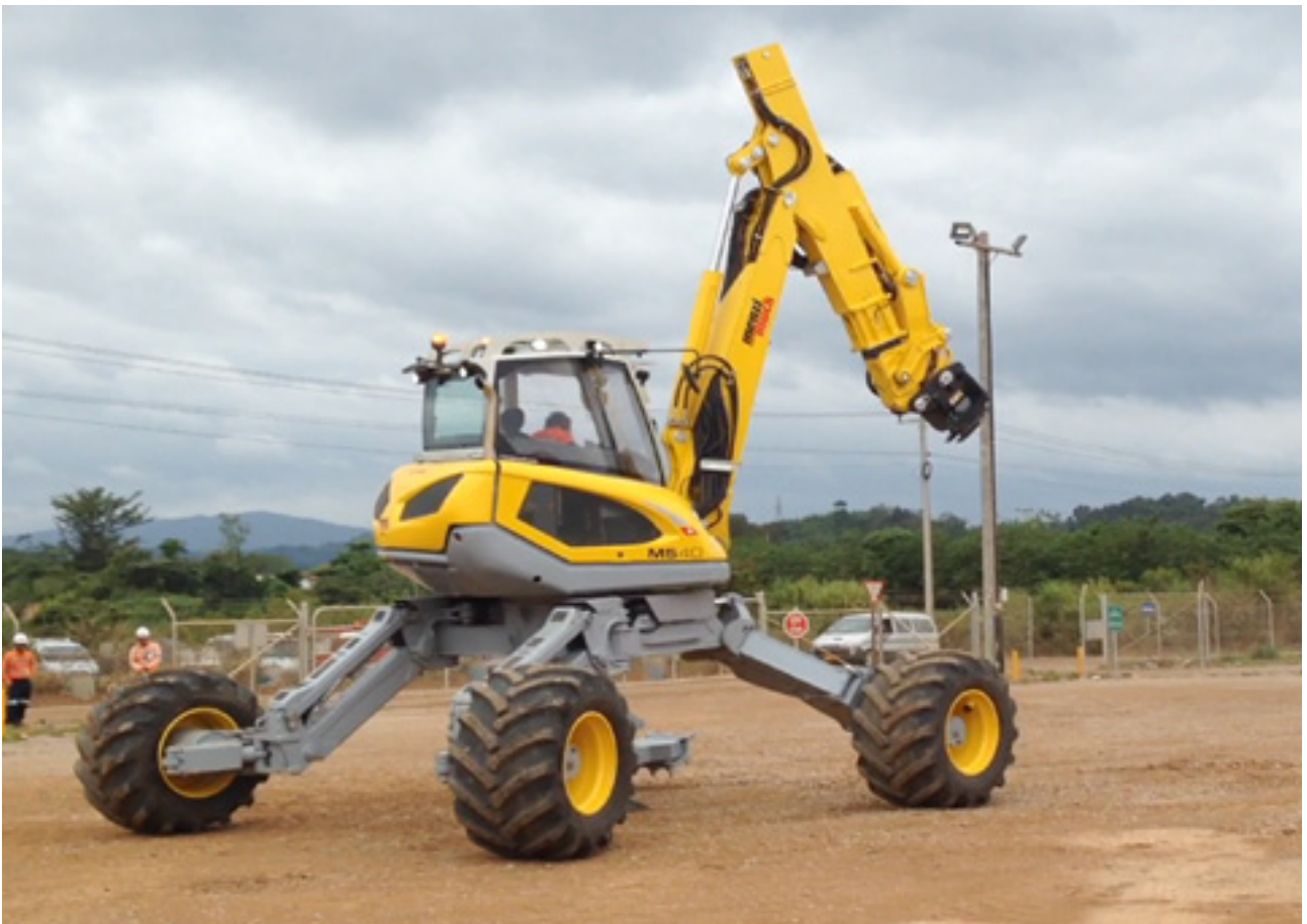
Menzi Muck demonstration in front of MMG-LXML Nalou Gate.

ຕື່ຫນ້າຫ້ອງການເກັບກູ້ລະເບີດ IN FRONT OF UXO OFFICE