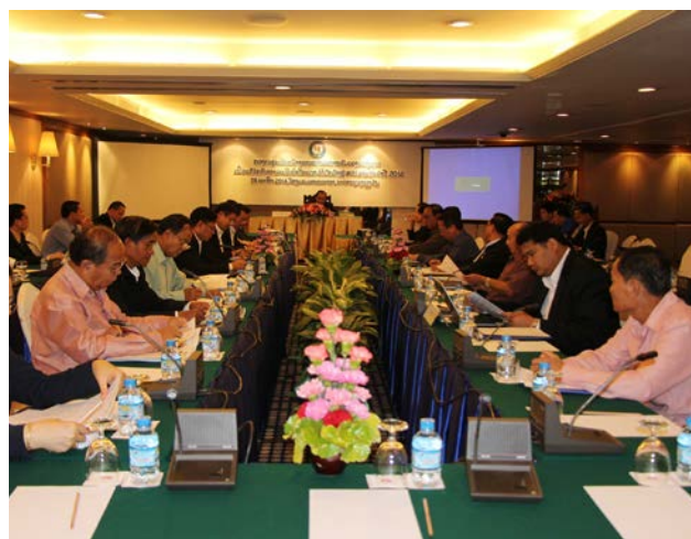
NRA Board Meeting for 2014, at Lao Plaza Hotel.