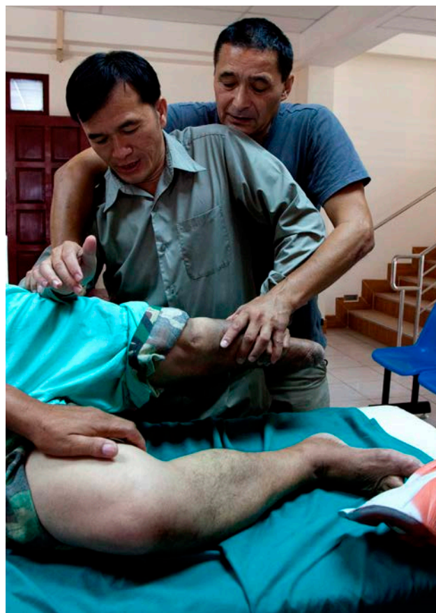
Practical exercises during the COPE-organized gait training course at the Center for Medical Rehabilitation (CMR) in Vientiane.

Furthermore, the COPE Connect outreach project aims to increase awareness and help connect people with needs to the available services. Due to lack of communication technologies, poor road networks, limited or no access to accessible transportation and, significantly, lack of financial resources, people with physical disabilities have been unable to access the CMR/PRC services.