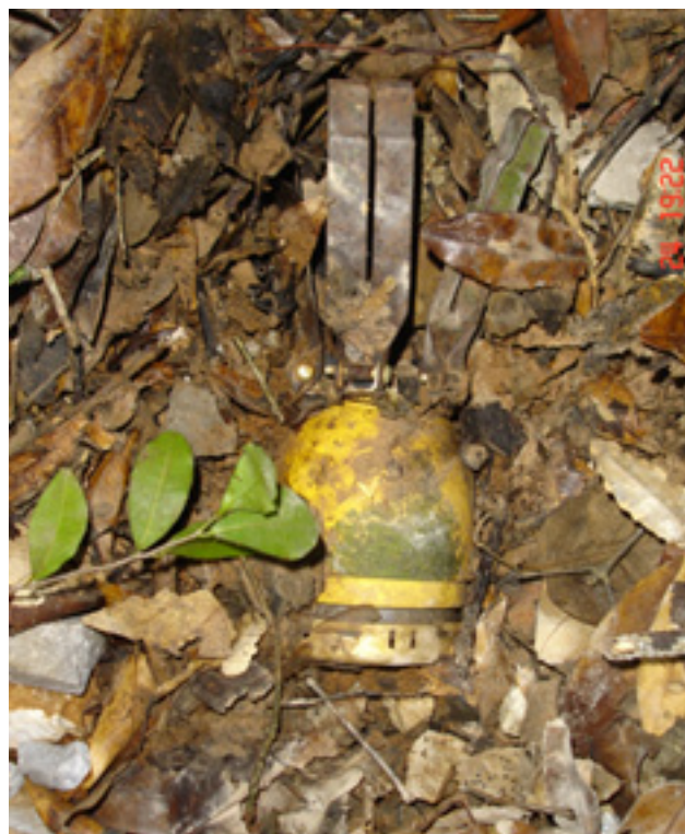
BLU-3B found on the surface.

The Menzi Muck, a state-of-the-art vegetation-cutting machine manufactured in Switzerland, also started its