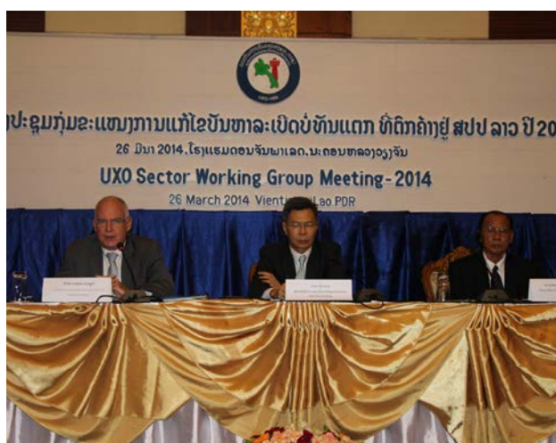
The first UXO Sector Working Group (SWG) for 2014.

On 26-28 August 2014, the NRA organized a workshop on UXO management for provincial authorities across the country. This workshop was attended by the same participants as the first meeting held in January. The aim was to train the person who is in charge for UXO management in their own provinces for better understanding on who is doing what between NRA centre and NRA provincial level. NRA management also highlighted to NRA provincial that the workshop was not aimed at listening to what the NRA centre had done but aimed to encourage provincial authorities to implement the correct role and act as UXO provincial authorities to control and to manage the UXO Sector because provincial staff are more familiar with the local realities in the provinces. In addition, the NRA Office also shared a new draft monthly report for provinces which includes substantive contents needed to be reported to NRA centre, especially, in the area of international staff's working, MRE, VA and Survey and Clearance. After the workshop, some provincial representatives met with NRA centre again for more learning on UXO work planning and budgeting, especially, how to budget for UXO clearance annually for development projects and how money will be used and where it will come from.