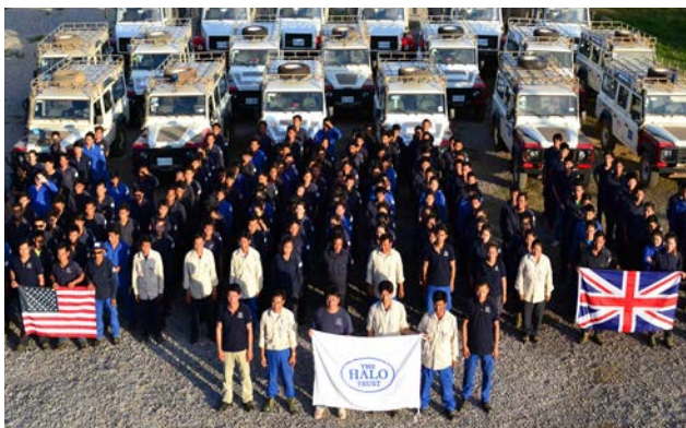
The HALO Laos Programme 2014.

HALO also introduced computer based reporting for technical survey through the innovative use of tablet computers. Using 3G in the field, survey team leaders report technical survey results directly to the HALO data cell, without the need for extra paperwork or lengthy radio calls. This significantly reduces the workload of the IM and the survey teams and is much more accurate than traditional paper based data entry.