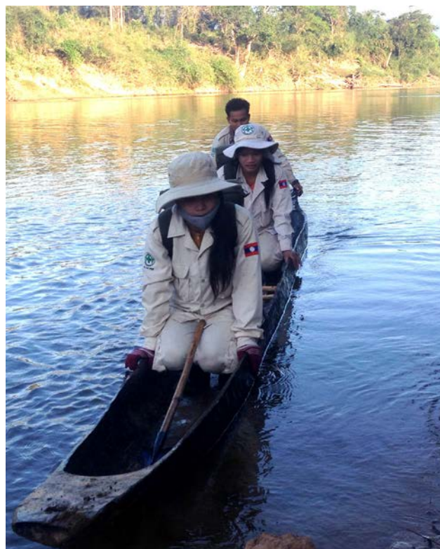
NPA Non-Technical Survey Team.

In the beginning of 2015 NPA will start operations in a fourth province, Xieng Khouang, in cooperation with UXO Lao.