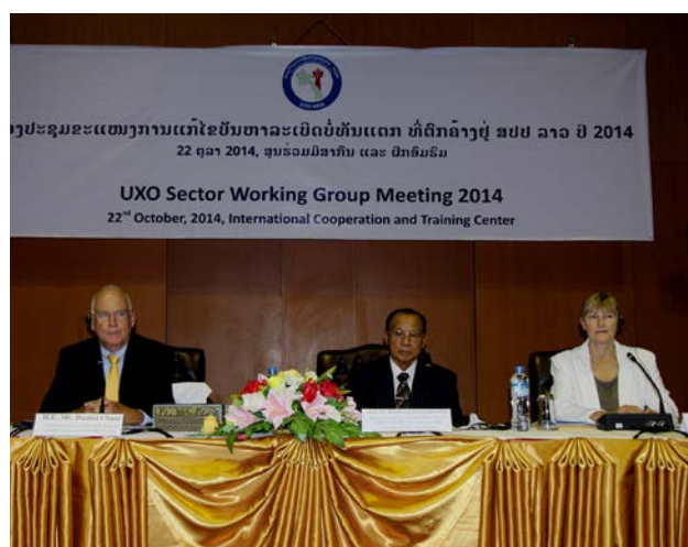
The second UXO Sector Working Group (SWG) for 2014.

On 21 October 2014, the UXO Sector Policy Forum was organized (in addition to 3 TWGs) on Policy, Coordination and Planning. More than 80 stakeholders participated, including Lao Government officials, development partners, UXO operators and technical advisers. Key topics discussed in the meeting included a progress update on data collected for UXO survey and clearance in the focus development areas; a progress update on the trial of the new UXO Contamination Assessment Procedures; the dissemination of the data collected on the needs of UXO survivors, and linkage with