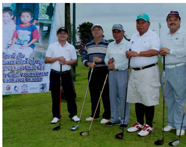
H.E. Mr. Bounyang Vorachith, Vice President of Lao PDR has joined with pleasure.

In 2014, the unit also organized a Charity Golf event to raise funds to support UXO survivors. These activities were attended by a large cross section of Government, UXO operators both humanitarian and commercial and other private sector enterprises.