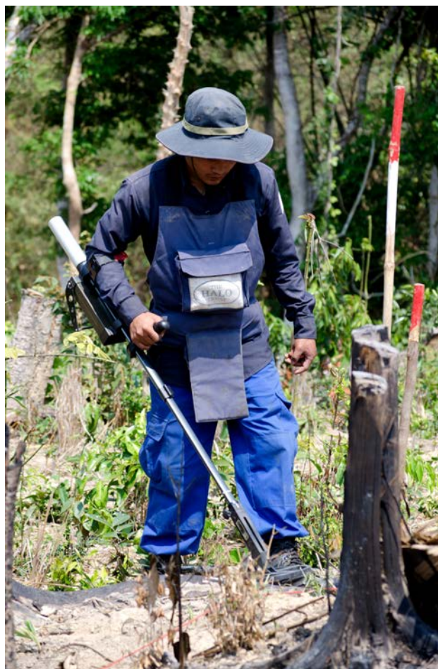
A technician isolates a signal on a clearance task located within Nonsomphou Village boundaries.

HALO's Community Outreach and Risk Education (CORE) team conducted targeted RE sessions, with separate sessions for age and gender specific groups. These sessions often provide additional information about contamination within a village and contribute to the picture built up through thorough non-technical survey. In 2014, HALO conducted 127 RE sessions, educating 7,598 beneficiaries.