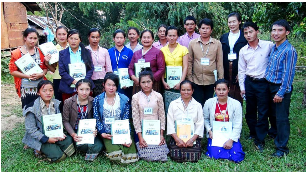
Handicraft training, organized by QLA.