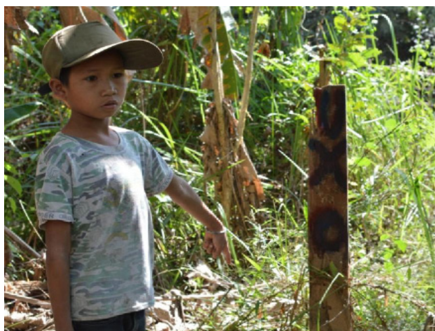
Muangchan village. After RE session, a child reports an UXO he had identified when hunting rats.