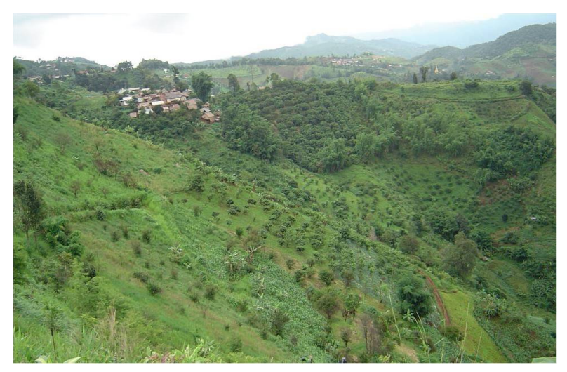
Doi Mae Salong landscape

Doi Mae Salong watershed is a rural mountainous area in northwest Thailand. It is the headwater of the Mae Chan River, a tributary of the Mekong River. Elevation ranges from 1200m to 1800 m above sea level. It is a multifunctional and highly fragmented landscape. On the hilltops there are areas of natural forest, consisting of a mix of dry forest, evergreen forest, bamboo forest and pine forest. These natural forests are frequently degraded. The slopes below are cultivated with upland rice, cash crops (e.g. corn), and coffee and fruit plantations. At lower altitudes tea plantations and rice paddies are cultivated.