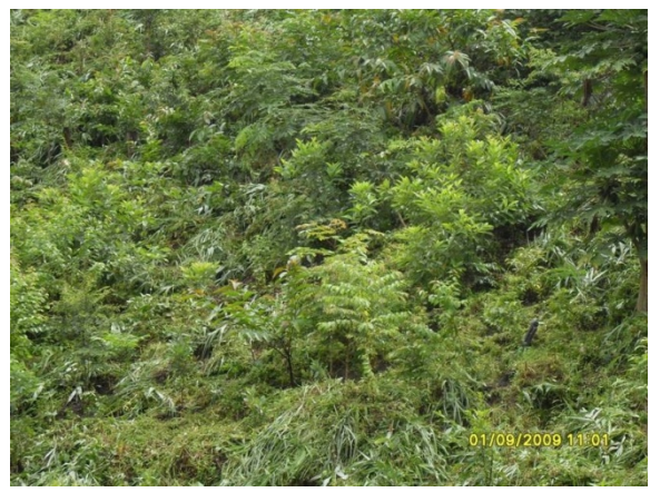
Close up of plot one and a half years after planting

There now is good understanding of the underlying causes of degradation in the past. Essentially these included bad land-use practices and poor location of agricultural activities. These were largely the result of the absence of any system of land-use planning or clear processes for allocating land for agriculture and other purposes. Institutional arrangements for improved land-use planning are now in place and