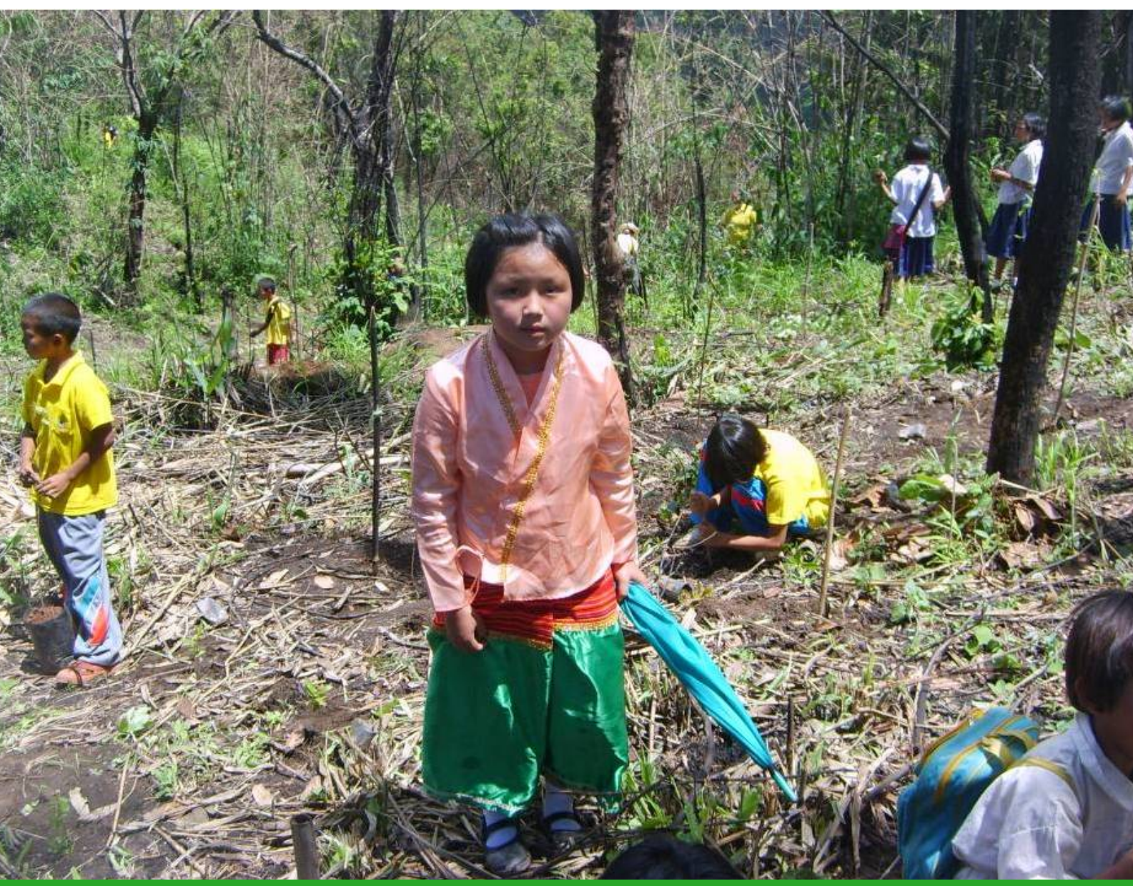
LIVELIHOODS AND LANDSCAPES STRATEGY - Landscape paper n°5

Lessons for landscapes and livelihoods from the Doi Mae Salong landscape, Thailand