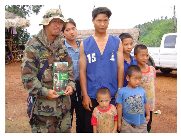
Working by building partnerships

There is something paradoxical about the Doi Mae Salong landscape. The involvement of a partner naturally seen as authoritarian and non-participatory (the military) is counter-intuitive. When Doi Mae Salong was first being considered it was often pointed out that the partnership was very risky. In practice, the partnership has been remarkably successful and the RTAF has been highly flexible and open to learning. There are perhaps two lessons here. One is that it is unwise to rule out unexpected partners without exploring possibilities.