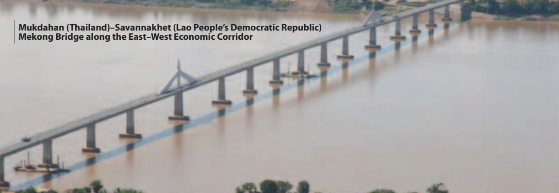
Mukdahan (Thailand)–Savannakhet (Lao People's Democratic Republic) Mekong Bridge along the East–West Economic Corridor