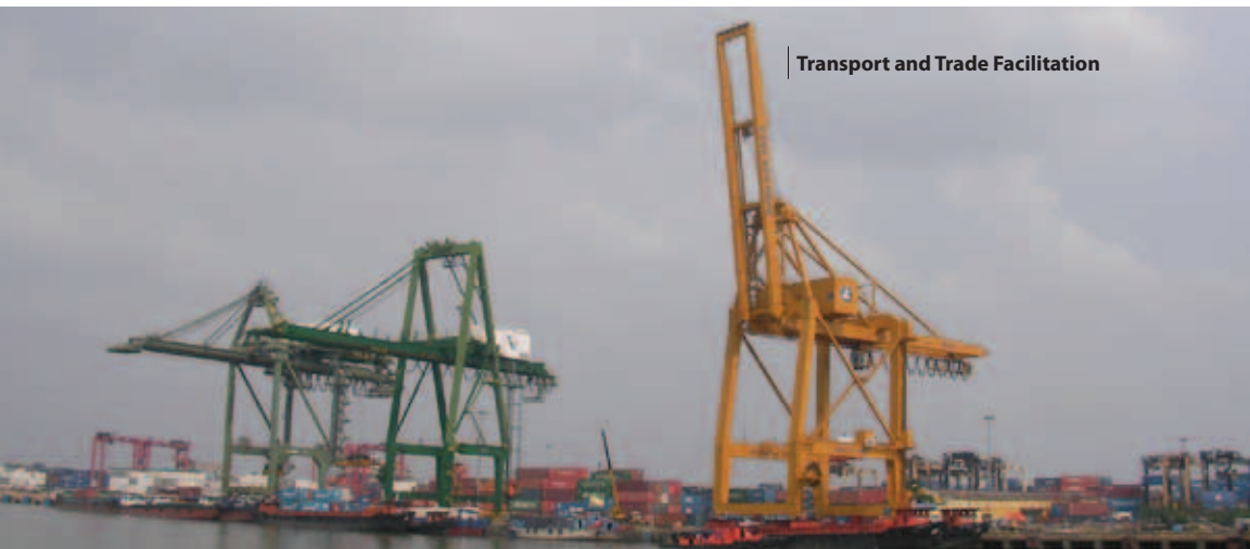
Transport and Trade Facilitation

An important component of TTF initiatives is the Cross-Border Transport Agreement (CBTA) between the member countries. Implementation of the CBTA has been initiated at selected pilot border crossing points in the subregion. The CBTA provides a practical approach to streamlining regulations and reducing nonphysical barriers in the GMS. It seeks to simplify inspection procedures and visa formalities, promote exemptions from inspection of goods in transit, and enhance the exchange of traffic rights so that vehicles in one country can operate in the neighboring country. ■