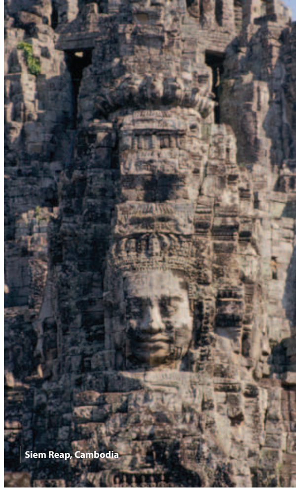
Siem Reap, Cambodia

A revised spatial strategy and road map for 2011–2015 was endorsed by the Third GMS Tourism Ministers' Meeting in January 2011. This focuses on the development of multi-country tour circuits along the GMS economic corridors and the Mekong River tourism corridor. Priority programs include tourism-related HRD, subregional marketing and product development, and pro-poor tourism.