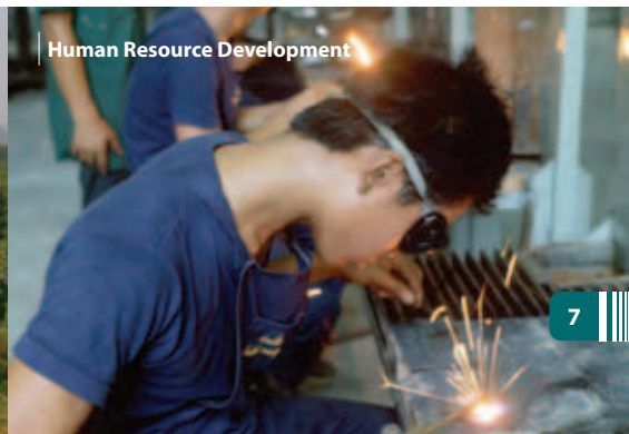
Human Resource Development