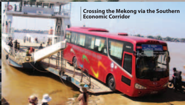
Crossing the Mekong via the Southern Economic Corridor