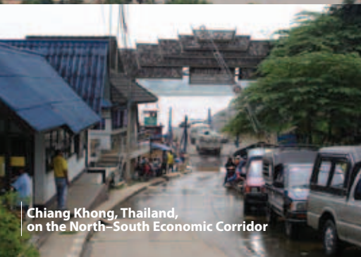
Chiang Khong, Thailand, on the North–South Economic Corridor