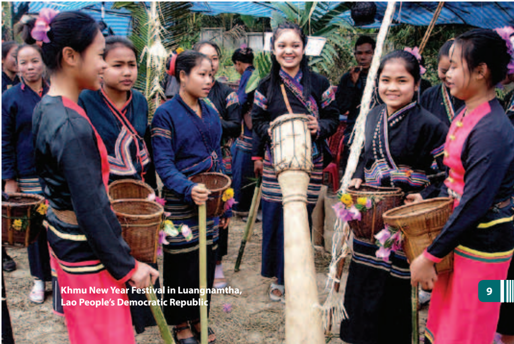
Khmu New Year Festival in Luangnamtha, Lao People's Democratic Republic