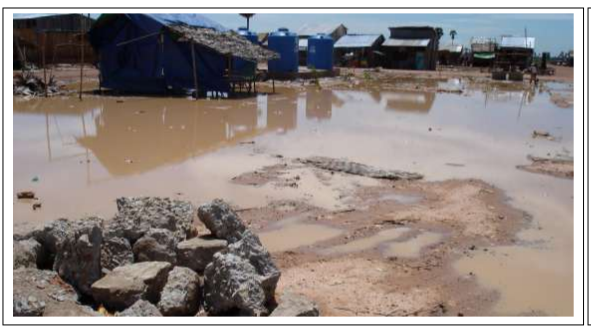
Figure 3: June 2006:residents from the Bassac riverfront area in Phnom Penh were forcibly evicted to this site over 20 kms outside the city. It was the start of the rainy season and virtually no infrastructure was in place (see image).

For those who were renting at Bassac a site nearby at Phum Andong was established which did not even have plot boundaries. Over 1,500 families flooded into the site where dire conditions remain to this day