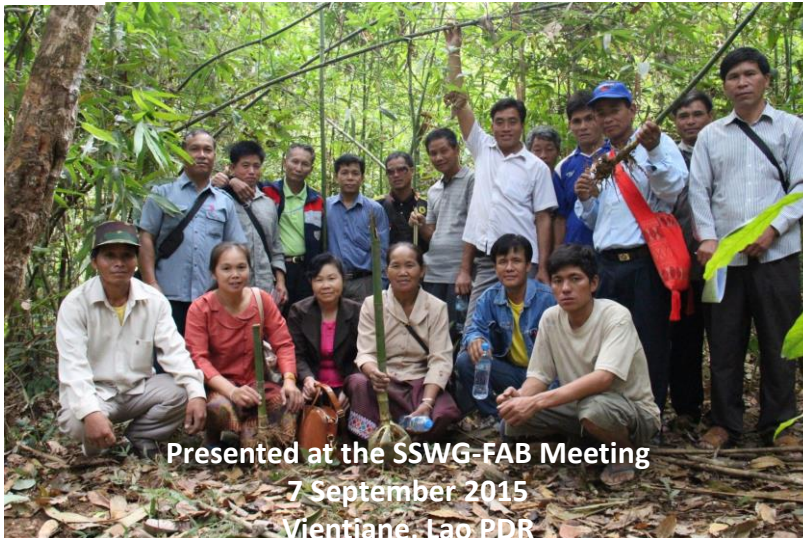
Presented at the SSWG-FAB Meeting 7 September 2015 Vientiane, Lao PDR

➤ Lao Farmers Network was established following exchange forums of Farmers Organisations in 2012 and 2013