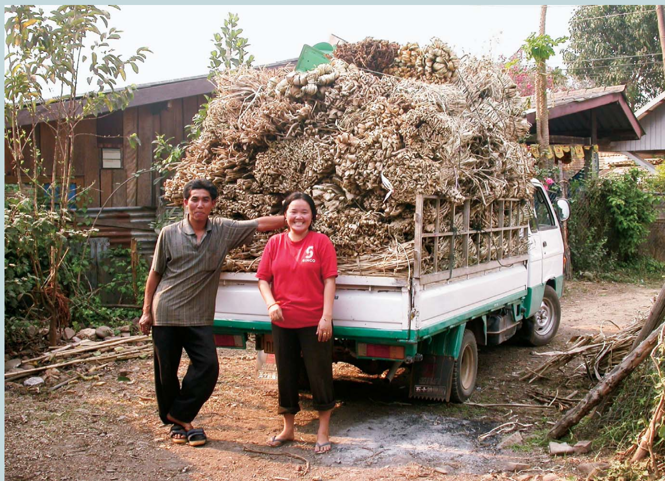
FIGURE 5 Selling collectives increase the scale of product sales and enable greater bargaining power—as is the case for paper mulberry ( Broussonetia papyrifera ) shown here.

To address these problems, the project put in place systems for training extension workers, improving storage systems, and introducing a simple market information system (MIS). The MIS was set up in 14 villages. Every 2 weeks, market prices and other information are collected for 14 products in these 14 villages. At the same time, the current prices for these products are obtained by fax from the agricultural office in Loei Province, Thailand, which is the main export destination. All this information is analyzed, summarized, and sent back within 2 days to all 14 villages, in the form of a poster that is displayed on a signboard in each village. This system is implemented by the district commerce officer and one project staff member. It