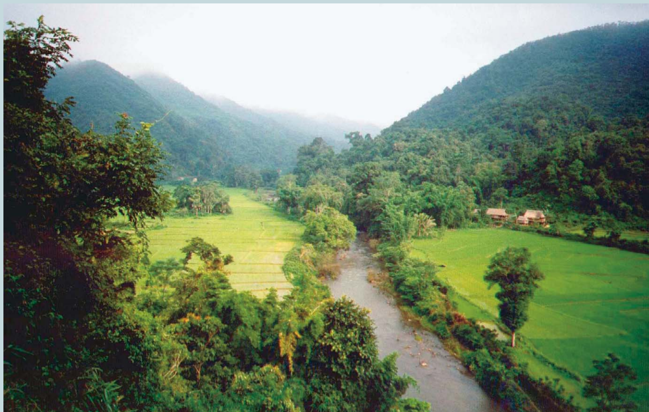
FIGURE 1 Typical forested landscape in northern Laos.

Despite these national measures, however, it is understood that information exchange has to begin with local networking, linking farmers to companies, map-