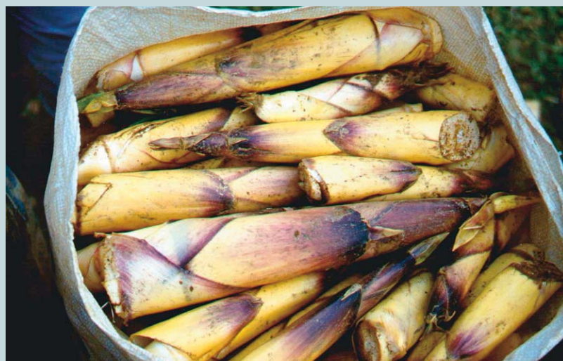
FIGURE 3 Bitter bamboo shoots ( Indosasa chinensis ).