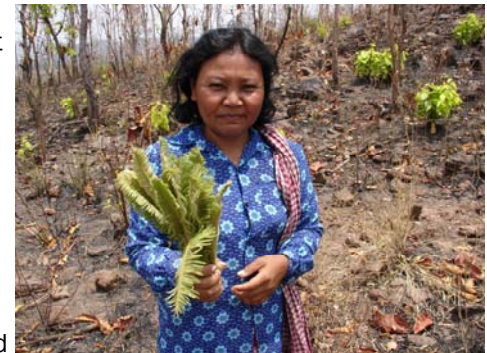
Villager collecting NTFPs