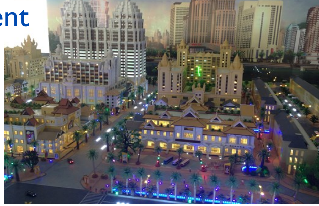
Model of future development in Boten Beautiful Land SEZ

Boten SEZ development plans hope to increase inhabitants to 300,000 in the near future, this SEZ will be focusing on trade and tourism, while sustaining Boten's natural mountainous environment. With these plans for expansion, SEZ authorities are concerned with labour management of foreign workers, along with protecting Lao workers who have lower skills and experience in the industrial sector.