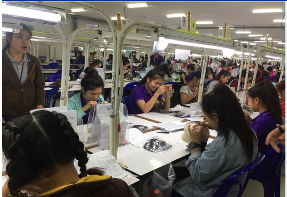
Factory workers in Savan-Seno Special Economic Zone

Special Economic Zones (SEZs) in Lao People's Democratic Republic