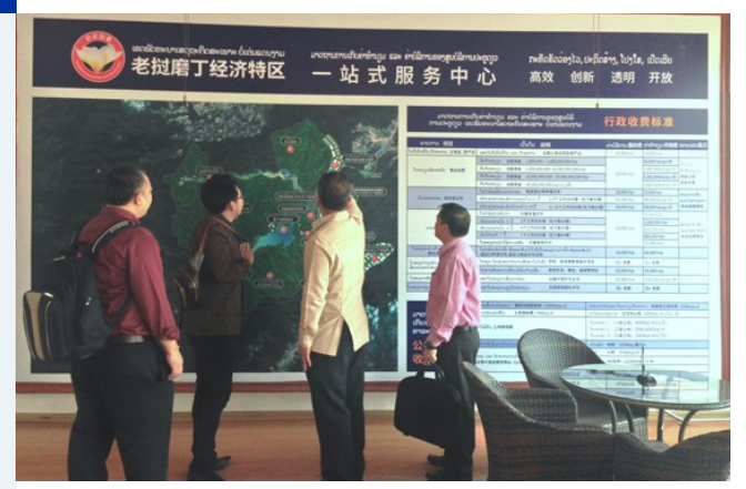
Boten Beautiful Land Special Economic Zone in Luang Namtha

IOM, in coordination with the Special Economic Zone Promotion and Management Office (SEZO) recently held a workshop on 'Overview of Best Practice in Regulating and Monitoring SEZs' in Luang Namtha, in which 52 government officials attended from Provincial offices of Luang Namtha, Bokeo, Savannakhet, as well as government officials from central level and relevant ministries. Representatives from the SEZs were also present, which provided a unique opportunity for all departments and relevant ministries to discuss current labour trends in the SEZs, concerns and next steps for future cooperation in addressing these issues.