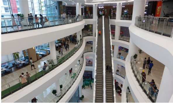
The Olympia mall in Phnom Penh. Another supermarket is now on the cards by Chip Mong Retail.