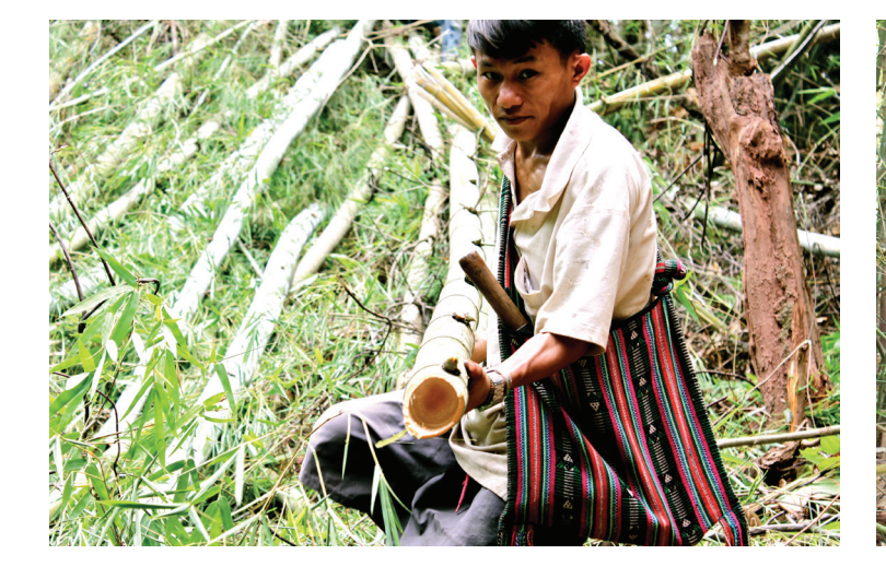
After the harvest: a Farmer inspects the bamboo culm.

Helping teak farmers to harvest more mature trees and increase the value of their holdings is only part of ForInfo's objectives in Bokeo. Ultimately, the project aims to lay the groundwork for a sustainable, efficient and competitive forest-based livelihoods system through the use of innovative approaches and closer collaboration between smallholders, forestry officials, sawmill owners, timber traders and credit associations.