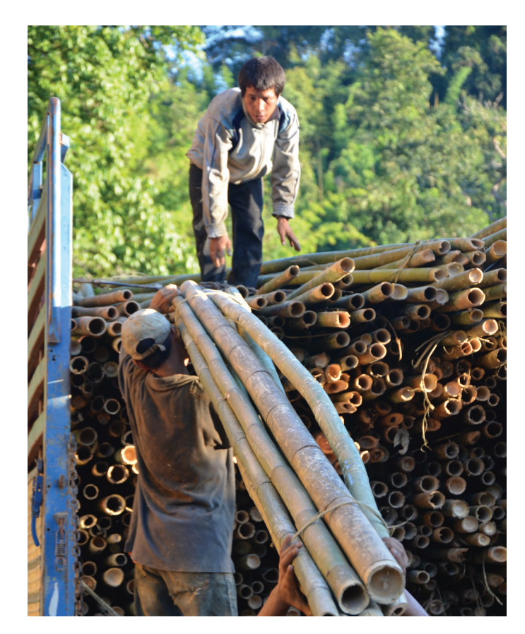
Manual loading of Bamboo poles for transport

As part of its strategy, ForInfo aims to raise local communities' awareness of environmental issues related to secondary bamboo forests, such as fire prevention, an overall shift to perennial cropping systems and improved forest management. In this regard ForInfo supports innovative information, education and communication campaigns in partnership with government agencies, local NGOs and other partners. Also planned are exchange visits and comparative biomass inventories, with small-scale bamboo producer groups in the Ngao Model Forest in Thailand's Lampang Province, where secondary bamboo forests have been managed through harvesting for local handicrafts and charcoal manufacturing.