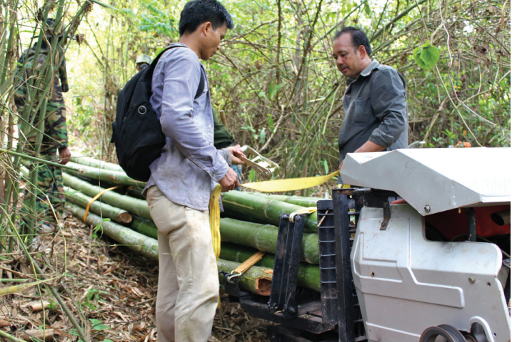
Ready for transport: the ForInfo bamboo crawler is loaded with over 350 kg's of fresh bamboo.