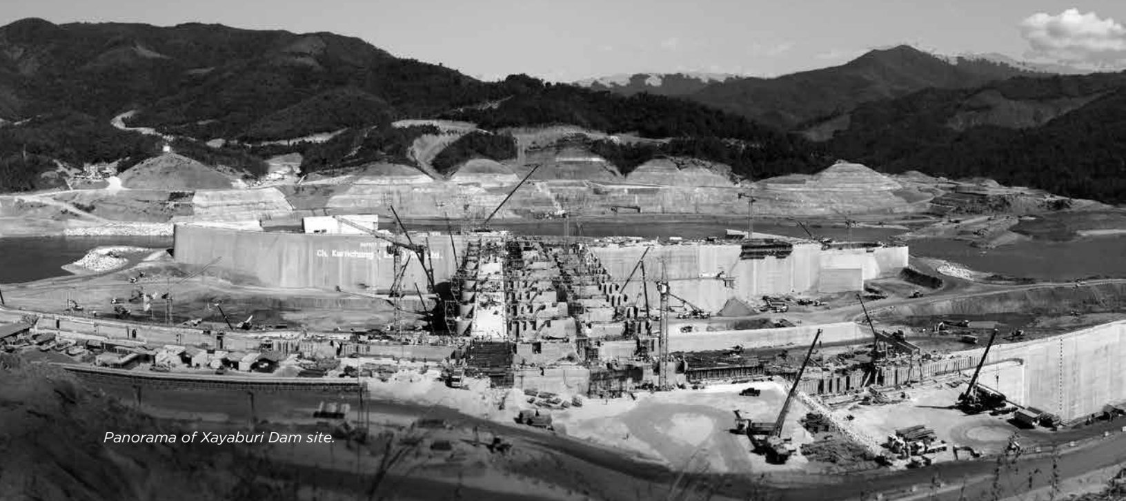
Panorama of Xayaburi Dam site.

CRITICAL TECHNICAL REVIEWS OF BOTH PROJECTS BY MRC EXPERTS HAVE CAUSED THE DEVELOPERS TO SPEND HUNDREDS OF MILLIONS OF DOLLARS TO ATTEMPT TO MITIGATE THE MOST IMPORTANT ENVIRONMENTAL AND SOCIOECONOMIC IMPACTS.