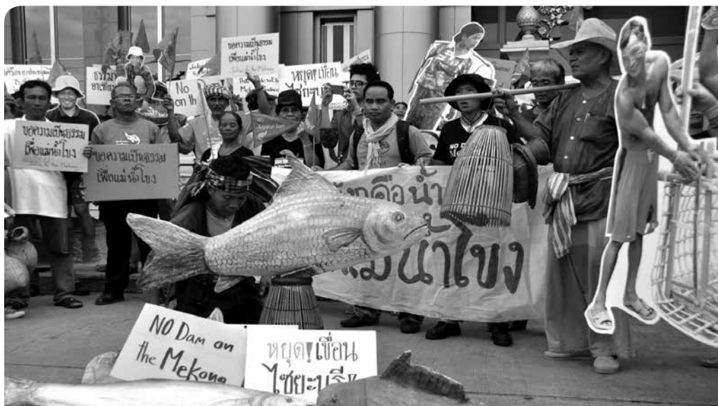
Villagers and fishermen protesting against the Xayaburi Dam.

ing agreement with the Xayaburi company failed to meet a constitutional requirement to address environmental and social impacts, has shown that companies involved in controversial projects can face costly legal action when they skirt their responsibilities.