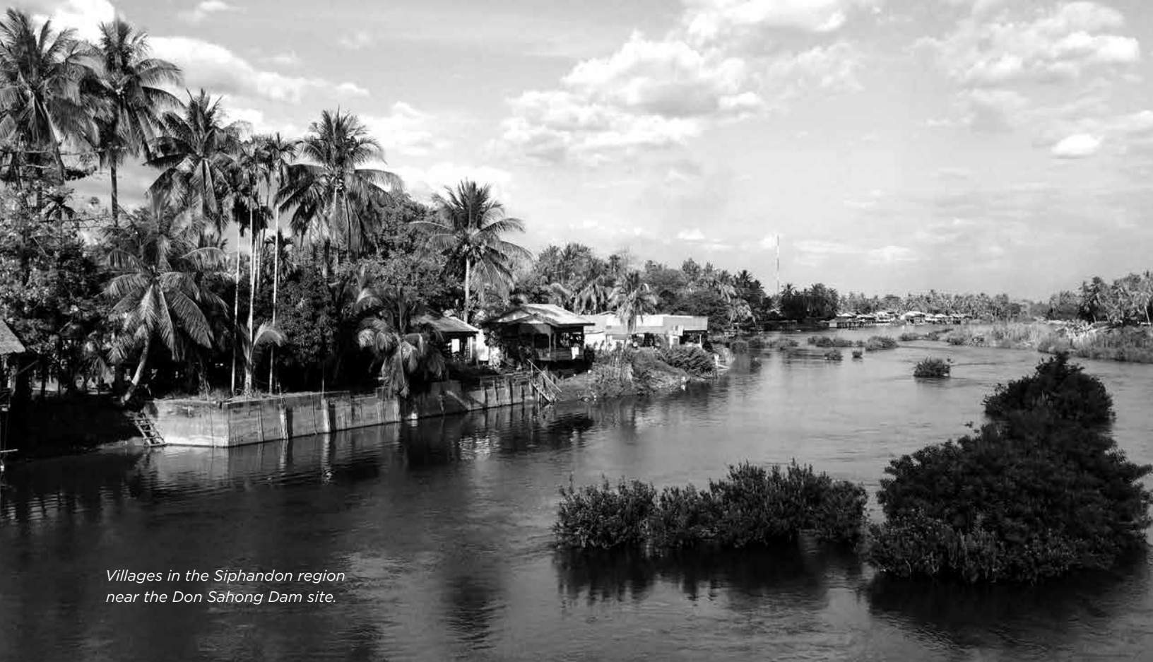
Villages in the Siphandon region near the Don Sahong Dam site.

THE CURRENT NARRATIVE IS OVERLY PESSIMISTIC... A NEW AND MORE NUANCED VIEW IS REQUIRED.