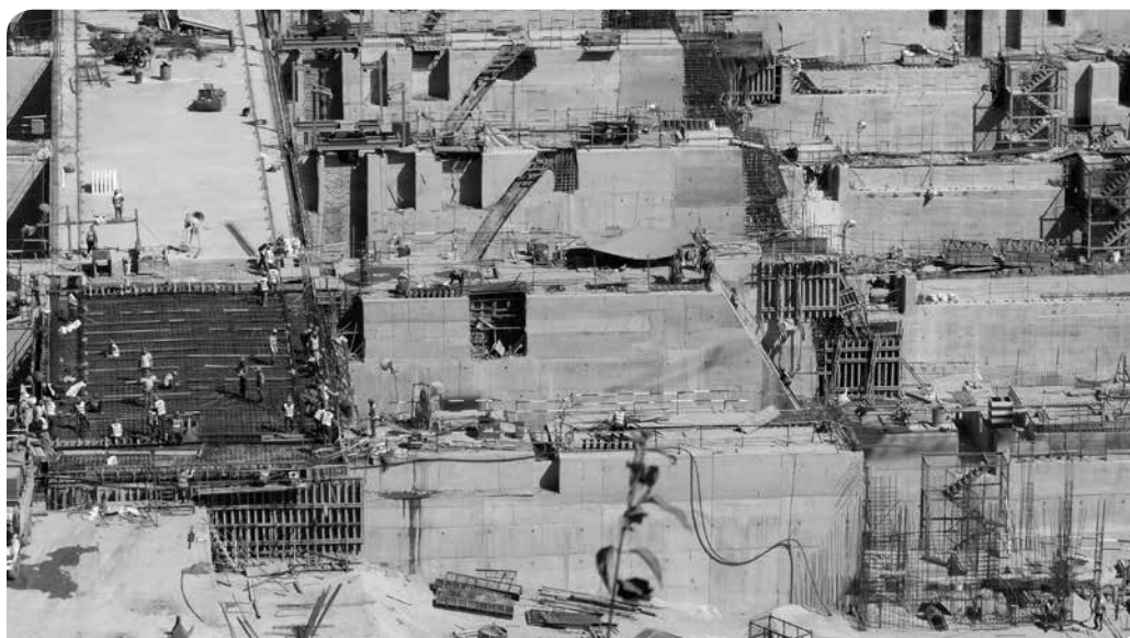
A close-up of construction of the Xayaburi Dam.

Our visit included meetings with the project's lead engineer, a relocation site officer, and a project manager from Poyry (a Finnish engineering firm and the main consultant for the project). All the representatives with whom we met acknowledged that the widespread criticism of the Xayaburi dam's original design for fish passages and sediment flushing, and particularly the recommendations of the MRC's technical review, led the developer to make major engineering changes and some innovations. According to the Poyry representative, parent company CH Karnchang has spent $200 million on fish research and passage redesign alone – more than any other major project in the region. The lead engineer noted that the changes required substantial modifications to the powerhouse and the dam structure. Xayaburi Power Company Ltd.'s changes include: