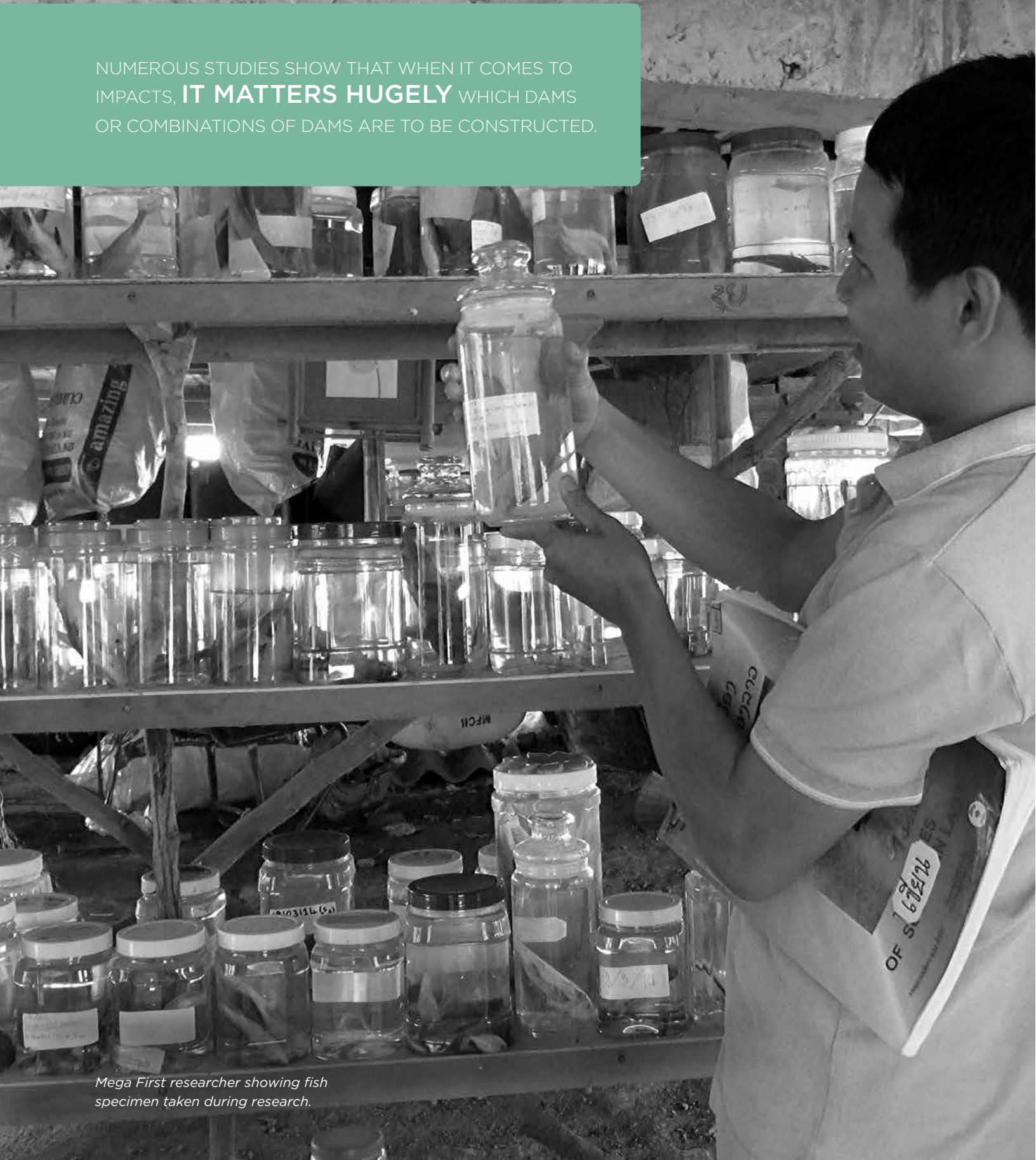
Mega First researcher showing fish specimen taken during research.

NUMEROUS STUDIES SHOW THAT WHEN IT COMES TO IMPACTS, IT MATTERS HUGELY WHICH DAMS OR COMBINATIONS OF DAMS ARE TO BE CONSTRUCTED.