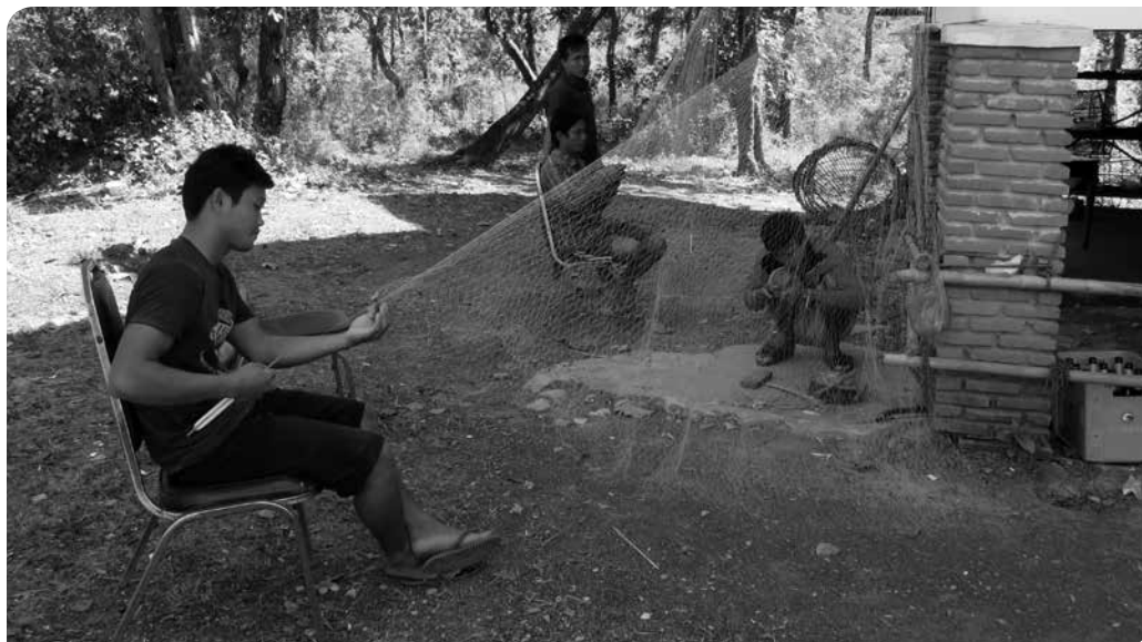
Mega First fisheries research team inspecting nets.