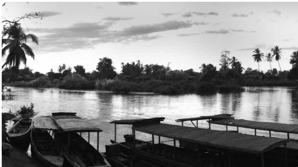
Boats on Don Khone Island near Don Sahong.

had a national grid, it could sell a combination of baseload and peaking power from existing and planned dams on Mekong tributaries and receive export revenue on par with that gained from building the nine mainstream dams. This would require upgrading the older dams on the tributaries and linking them into the national grid, but would give Laos the short-term revenues that it desires without further disrupting the river. 32