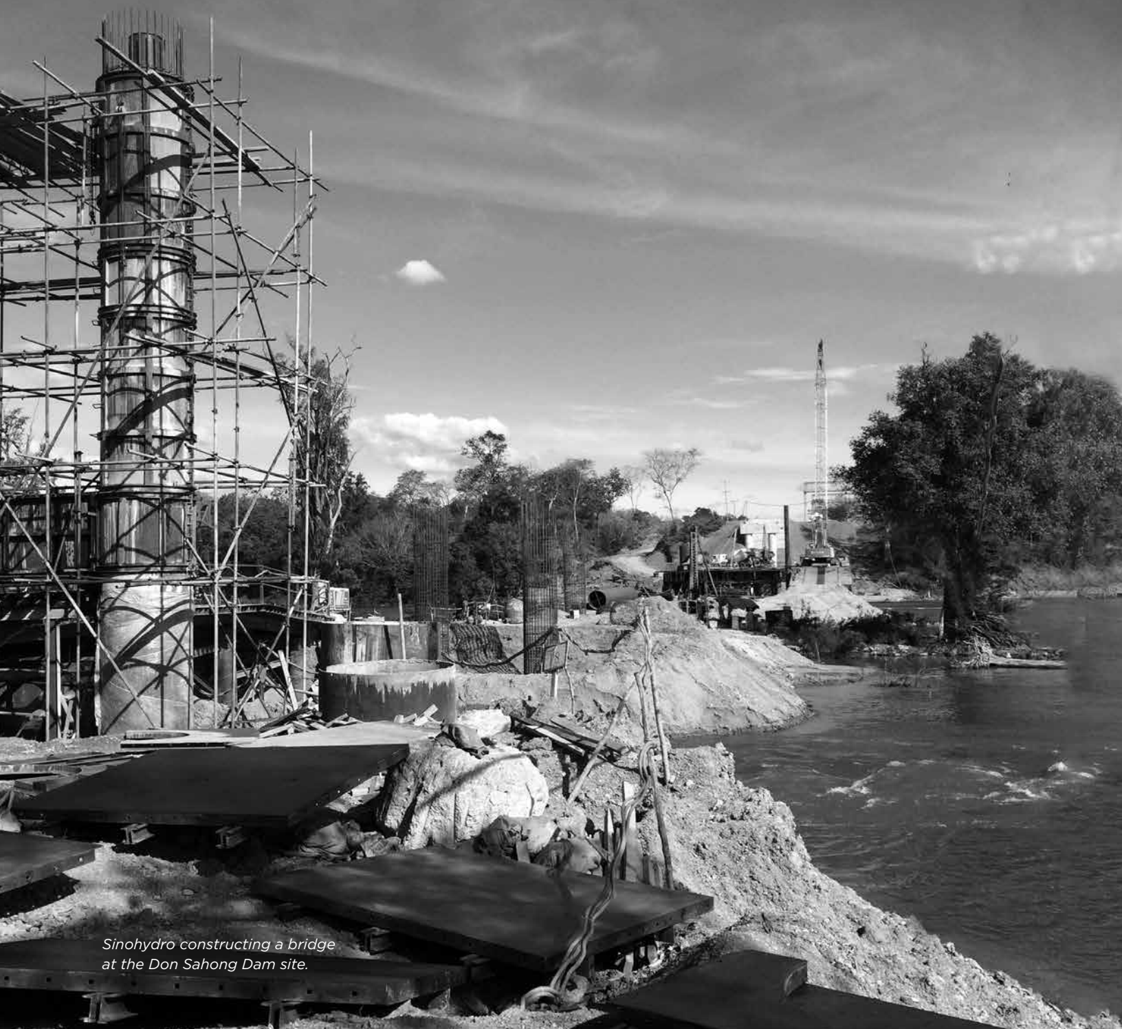
Sinohydro constructing a bridge at the Don Sahong Dam site.

THESE LONG-TERM SOURCES OF RISK ARE INCREASINGLY RECOGNIZED IN CHINESE INSTITUTIONS