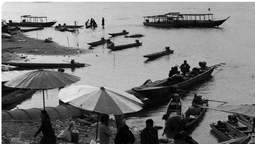
Ban Nakaseng port village near Don Sahong.

resettlement zones. Our visit to Xayaburi indicated that while the living standards have risen for some villagers, the transition from subsistence living to a market-based economy and a lack of marketable skills in the villagers' new environment posed challenges for many families that have been relocated. Current and future developers must conduct needs assessments with villages in a consultative manner, observing land and water use patterns of villagers for a significant amount of time before relocation, this could be taken into account when identifying relocation sites and designing support programs that are more localized.