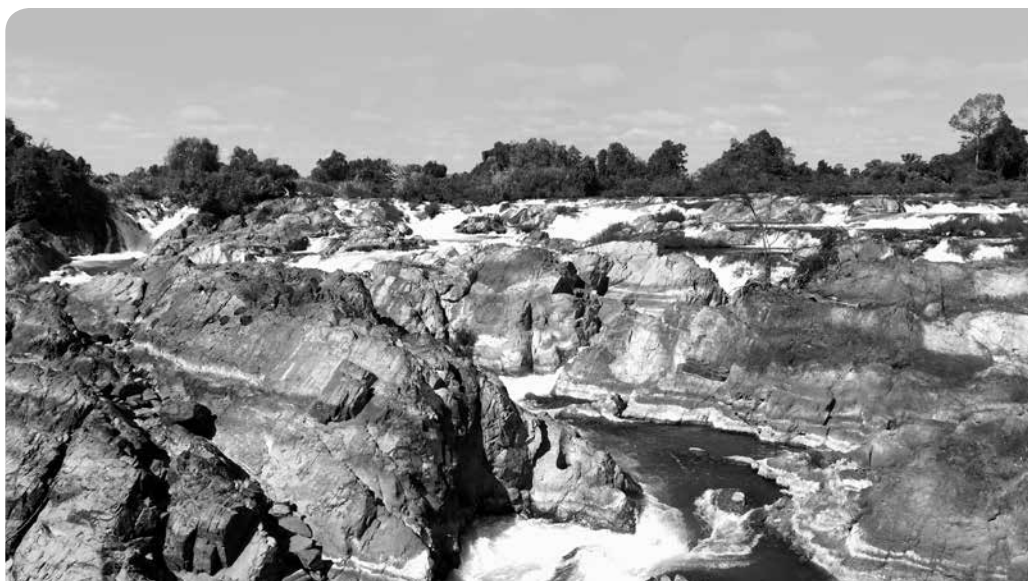
Li Phi Waterfalls in the Siphandon area near the Don Sahong Dam.

China's financial institutions have started to adopt "green credit" strategies and higher standards as a method of long-term risk management, 20 though many remain in name only as enforcement issues pose a serious challenge for all lending institutions. However, political pressure on banks to continue lending to companies backed by powerful political factions even when the borrowers do not recognize or mitigate risks is a major short-term challenge. The suspended Myitsone Dam is an example—lenders would have preferred to avoid backing the high-risk project, but China Power Investment Corporation was a major customer that they couldn't refuse outright without risking a loss of business. 21 Although under Xi Jinping administration China's banks increasingly require higher standards for EIAs early-on in the process, they don't yet have an effective method to address problems discovered after projects have already received funding. 22