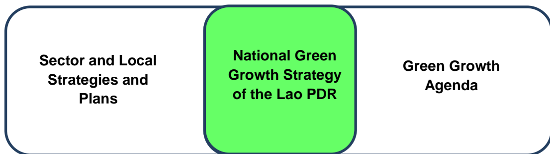
Chart 2: Relations between the National Green Growth Strategy of the Lao PDR and the Sector and Local Strategies and Development Plans