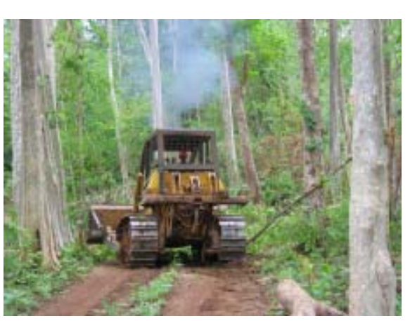
Vietnamese worker bulldozing a new logging road in the project area, Lamam district, Xekong province.

In trying to push PSFM in Xekong, the project hit a raw nerve with its government partners. Core ideals central to the success of community forestry ideals like democracy and transparency - are values that are not commonly held by those with political power in the system that dominates in Laos. Laos is not a democracy. It is a single-party, authoritarian state, where all decision-making authority is concentrated with the Communist Party, from the centre all the way down to the village level. The idea that villagers should have decision-making power over a valuable resource like timber, and that they should be given a significant share of the profits, is anathema to the dominant political culture in Laos. Simply put, the spirit of the PSFM legislation runs counter to the values that dominate Lao politics.