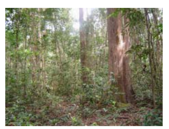
Typical semi-evergreen/mixed deciduous forest stand in Xekong Province, with May Bak, Anisoptera cochinchinensis, in the foreground.

Shortly after this, a Bank-led team of consultants published a harsh review of the Lao forestry sector, declaring on page one of the document that it was in "disarray". Following this, negotiations between the World Bank, the Government of Finland and the Lao government began on a national forestry reform package. Several critical elements