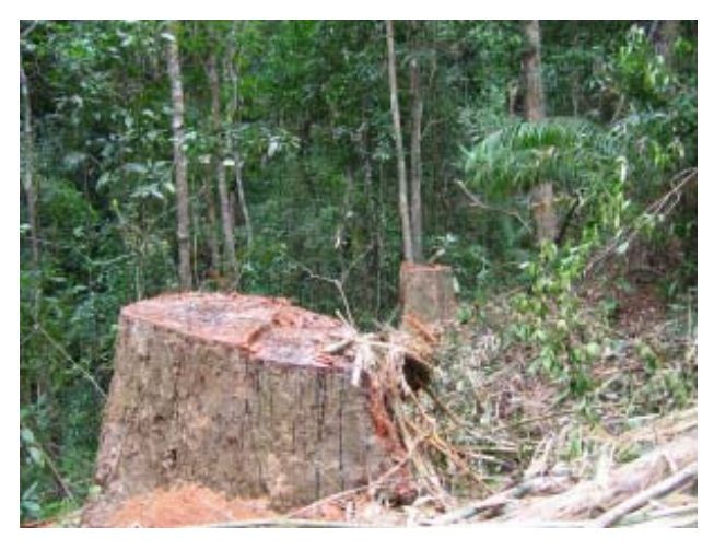
Stumps of trees removed from within the project area, in this case May Nyang Deng Dipterocarpus turbinatus.

Politically, the PSFM model is not supported because it seeks to increase community participation in a sector where decision-making authority has always rested solely in the hands of the state. The Xekong project, in accordance with PSFM legislation, was increasing villager participation in forest planning, management and benefit sharing. As was articulated by villagers on several occasions in meetings with government officials, villagers saw the project as a way to assert greater control over