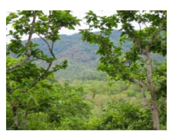
Forest mosaic in Xekong province – dry dipterocarp stand in the foreground, looking through to semi-evergreen/mixed deciduous hill forest.

gain – hence their support – while those who currently make all the decisions related to logging stood to lose out significantly. For these reasons, it is easy to understand why, in the end, support evaporated for the project.