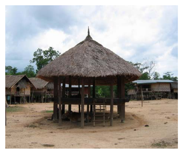
Communal structure in the centre of a Nge/Krieng ethnic minority village in Xekong province.

There is vast potential for forestry to play an important role in development in Laos. Hemmed in by big neighbours like China, Thailand and Vietnam that are largely depleted of natural forest, the relatively large remaining tracts of for-