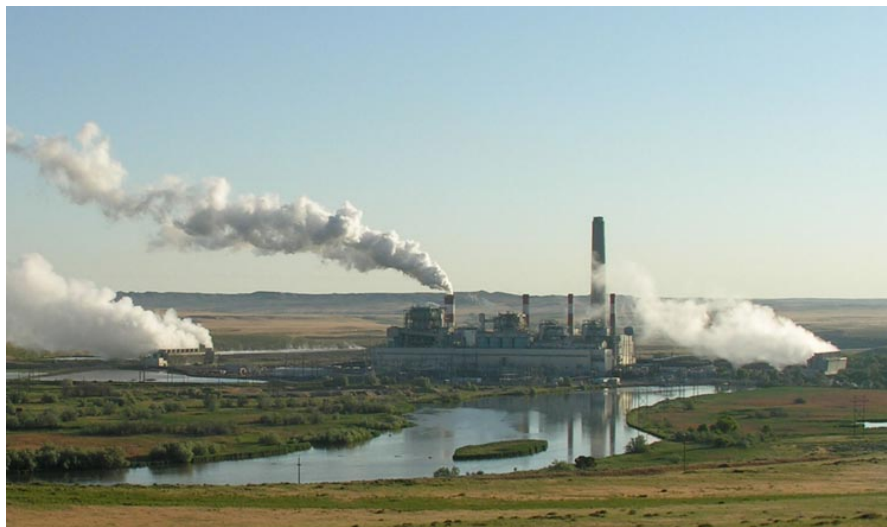
Dave Johnson coal-fired power plant, central Wyoming, US.