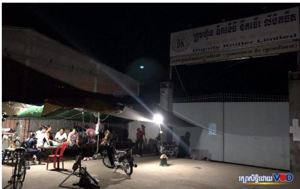
Former Dignity Knitter workers rest under a tent in front of the closed garment factory in Takhmao City on May 1, 2020.