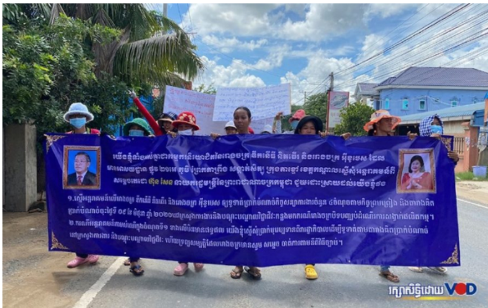
Workers from garment factories Dignity Knitter Limited and Eco Base march to submit a petition to the Kandal Provincial Court over unsettled compensation claims on July 13, 2020.

“I'm like a floating plant just drifting around,” she says. “I can't go forward or backward.”