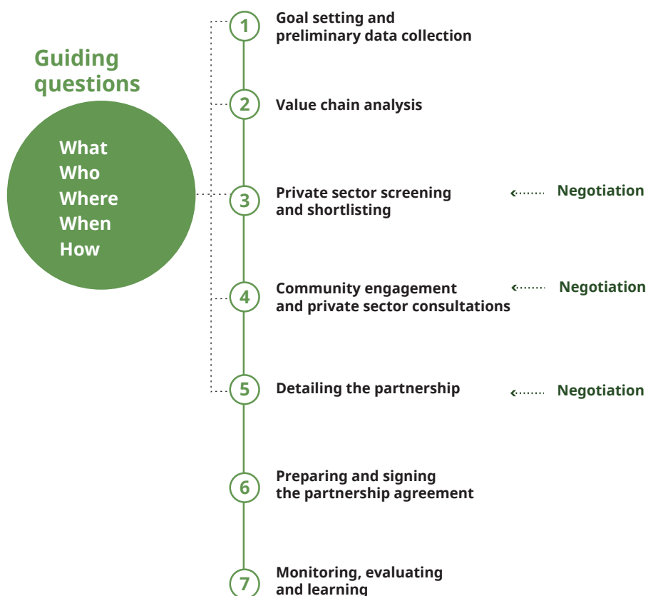
Figure 2. Suggested process for developing a partnership agreement

The facilitation process to develop a local community–private sector partnership involves seven steps covering several bilateral and multilateral meetings and assessments, as figure 2 illustrates. Any organization or agency can facilitate such a process. This guide speaks to RECOFTC field practitioners and what they can do through the FLOURISH project.