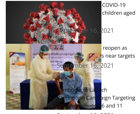
September 16, 2021