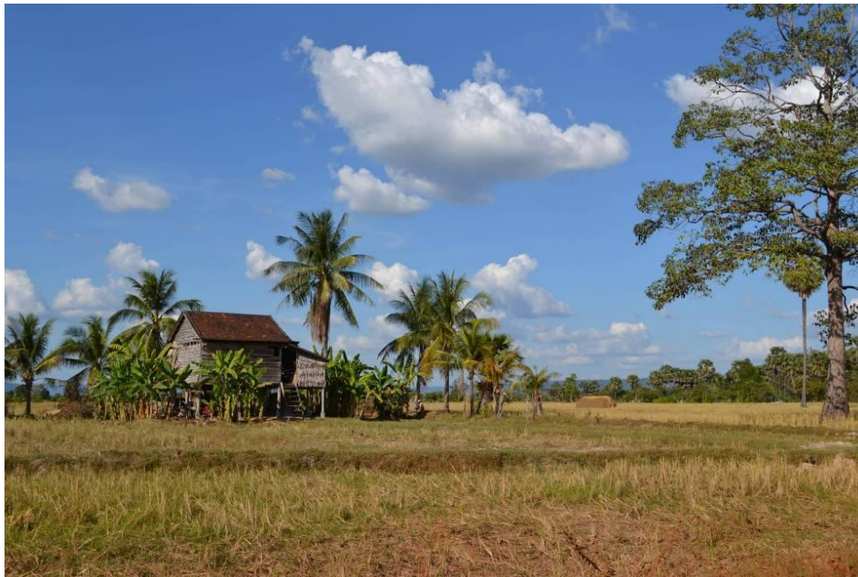
A village in Siem Reap province, Cambodia, near a potential REDD+ project area (Chapman, 2012)

This Brief provides an overview of the existing policies, law and institutions relevant to REDD+ implementation in Cambodia, and also outlines current REDD+ initiatives in the country.