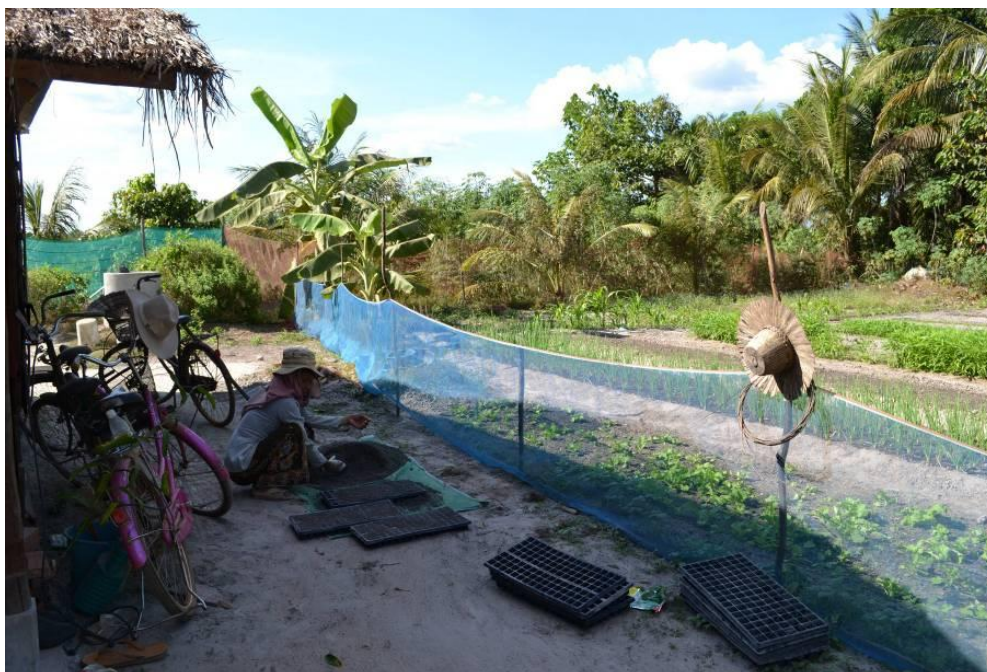
A sustainable livelihood project in Siem Reap Province, Cambodia ( Chapman, 2012 )

Fauna and Flora International (FFI) in collaboration with the Forestry Administration is implementing the project aimed at strengthening the participation of local communities and local government officials in REDD+ implementation. The European Union (EU) is the main funder of this project. The project is expected to close in 2014.