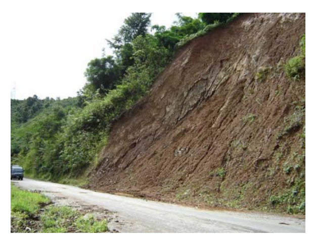
Fig 3. Typical below road failure (assigned Risk No 18)