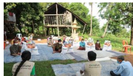
ChildFund feeding poor families

Modernised government services goal of digital plan